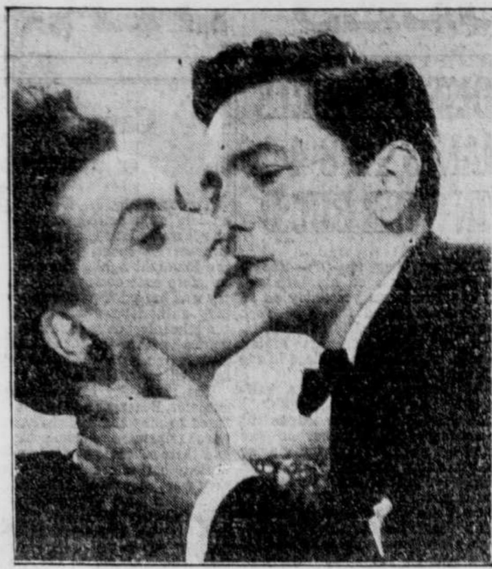
Maureen O'Hara and John Garfield in "The Fallen Sparrow," beginning today at the Granada Theatre.

Co-starring John Garfield and Maureen O'Hara, "The Fallen Sparrow," which opens today at the Granada, is one of the finest vehicles in which either of these favorites has appeared. It is the first in which they are seen together. The action - crammed story of enemy intrigue against an American adventurer and his friends takes place in New York City shortly before our armed entry into World War II. This action is a result of the hero's earlier participation in the struggle against Fascism, as a soldier in the Spanish civil war.