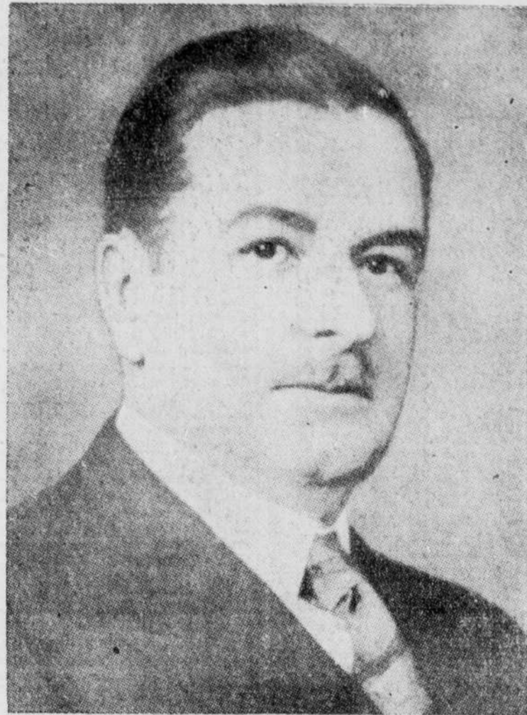
HON. MAURICE DUPLESSIS