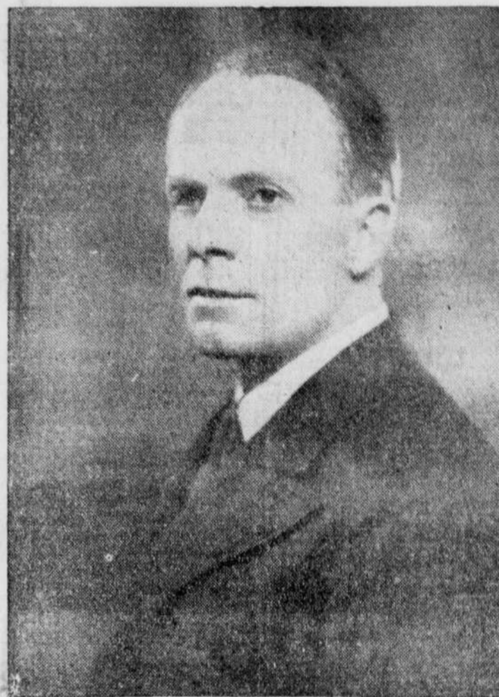
HON. ADELARD GOUBOUT