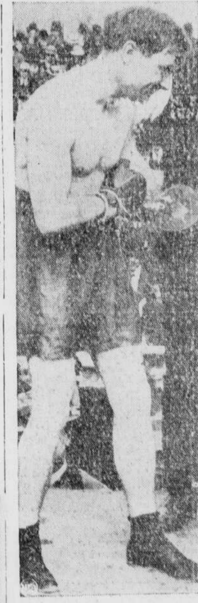
Jimmy Britt knocked out two former champions in his first year as a professional.