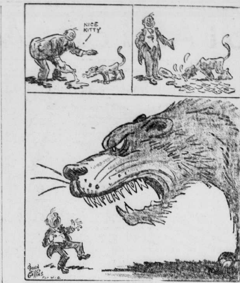
HOW IT GROWS