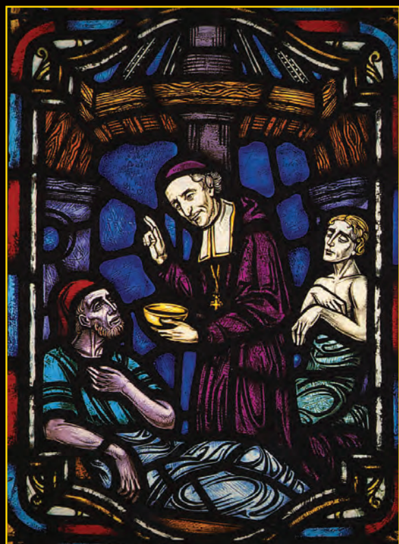
Blessed François de Laval first bishop of Québec 1623-1708