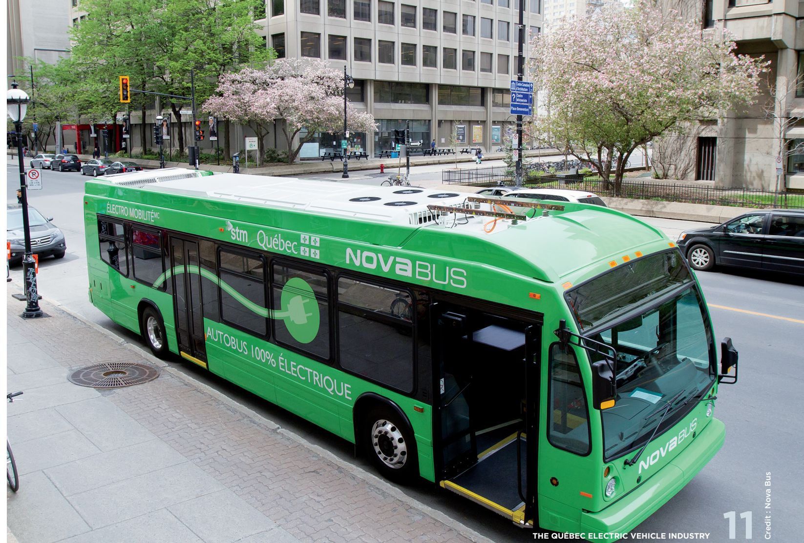
THE QUÉBEC ELECTRIC VEHICLE INDUSTRY

Accordingly, the adoption rate of low-emission motor vehicles in Québec is now one of the highest in North America. Furthermore, the international City Mobility program, which the Québec government supports, has selected Montréal as its first North American partner city. The initiative of Volvo Group and its Nova Bus North American division seeks to accelerate the adoption of clean, efficient, connected urban transportation systems that satisfy the needs of the 21 st century.