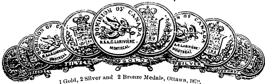
1 Gold, 2 Silver and 2 Bronze Medals, Ottawa, 1879.