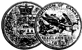
Gold Medal, London, 1885.

5 Gold Medals, 5 Silver Medals, 2 Bronze Medals, awarded to N. & A. C. LARIVIERE, for best display of Carriages & Sleighs and Superior Workmanship.