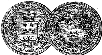
The only Prize Medal, Montreal, 1882.

Over 100 First Prizes and Diplomas awarded to us since 1865 for best Carriages & Sleighs OF ALL KINDS.