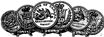
1 Gold and 2 Silver Medals, Montreal, 1884.

Over 100 First Prizes and Diplomas awarded to us since 1865 for best Carriages & Sleighs OF ALL KINDS.