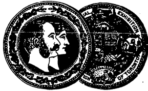
5 Gold Medals, Toronto, 1888-89.