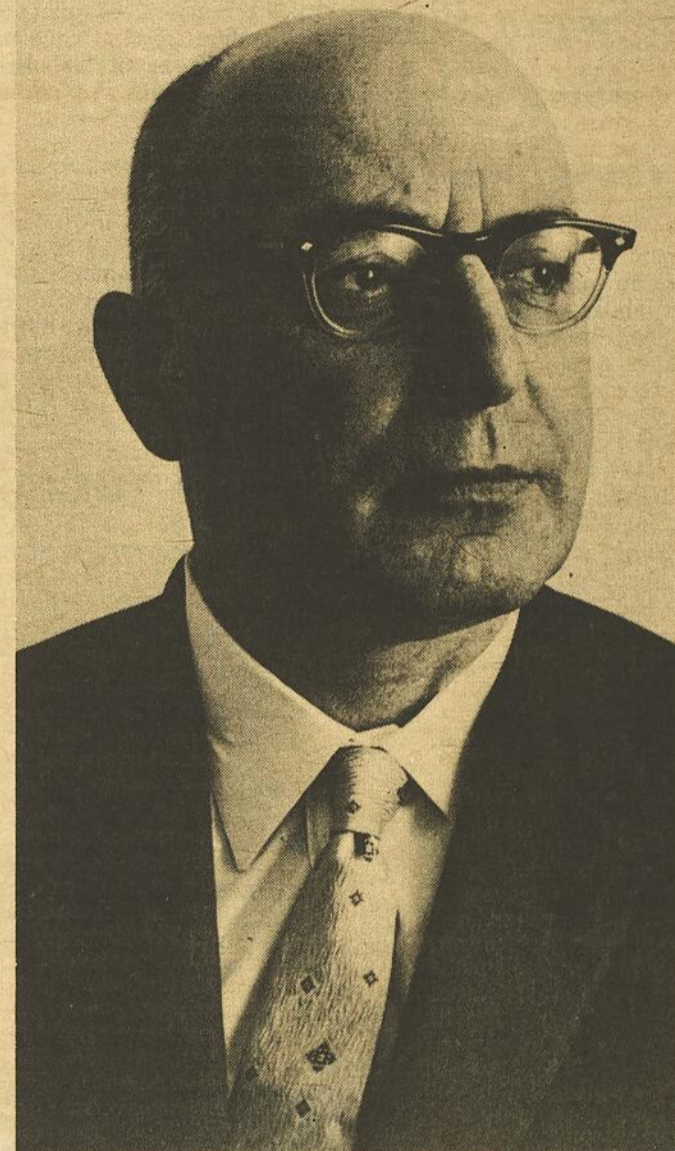
Chairman of the Jewish Agency and World Zionist Executive and former Finance Minister of Israel will be missed by all who knew him.