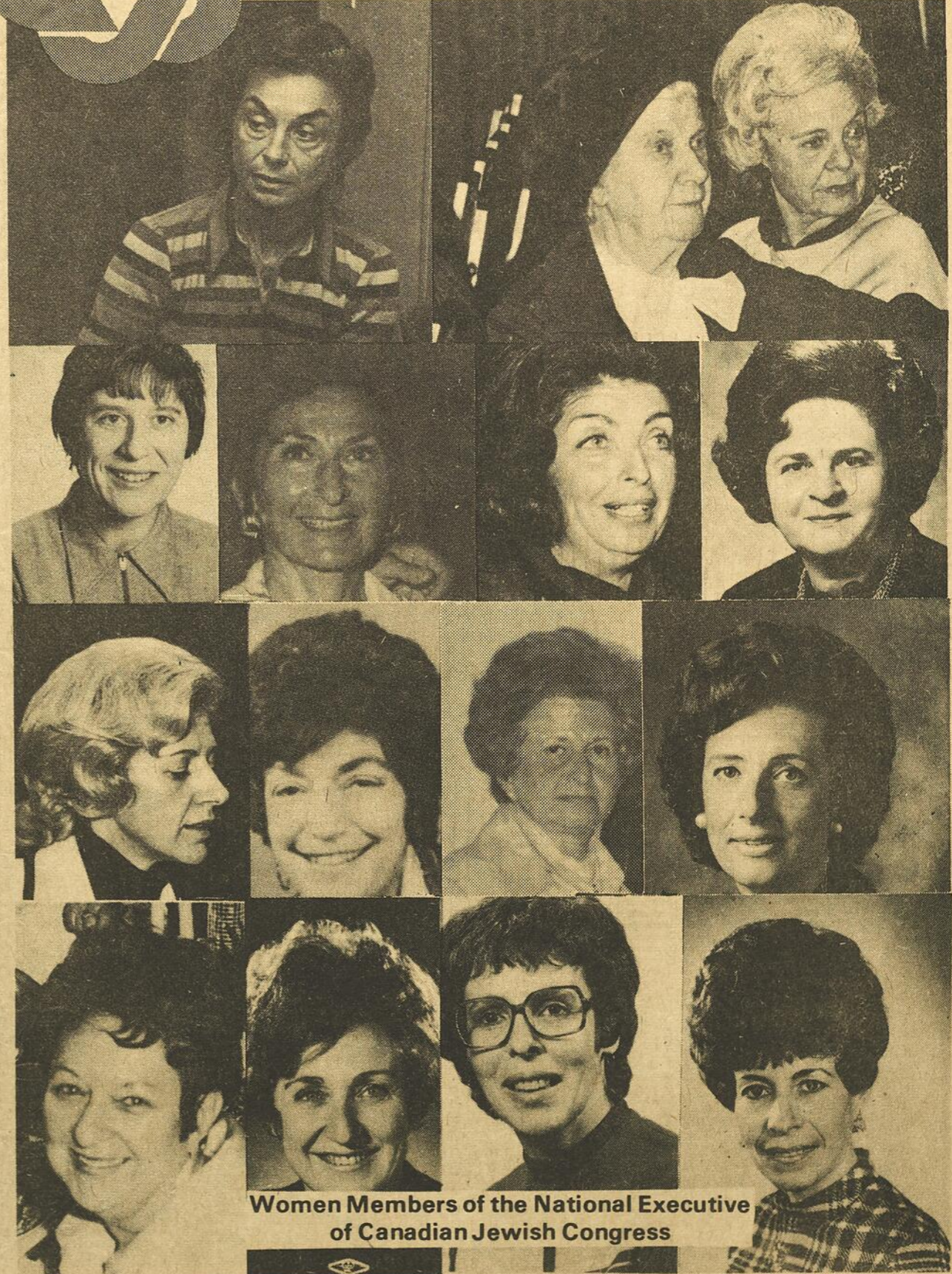
Women Members of the National Executive of Canadian Jewish Congress