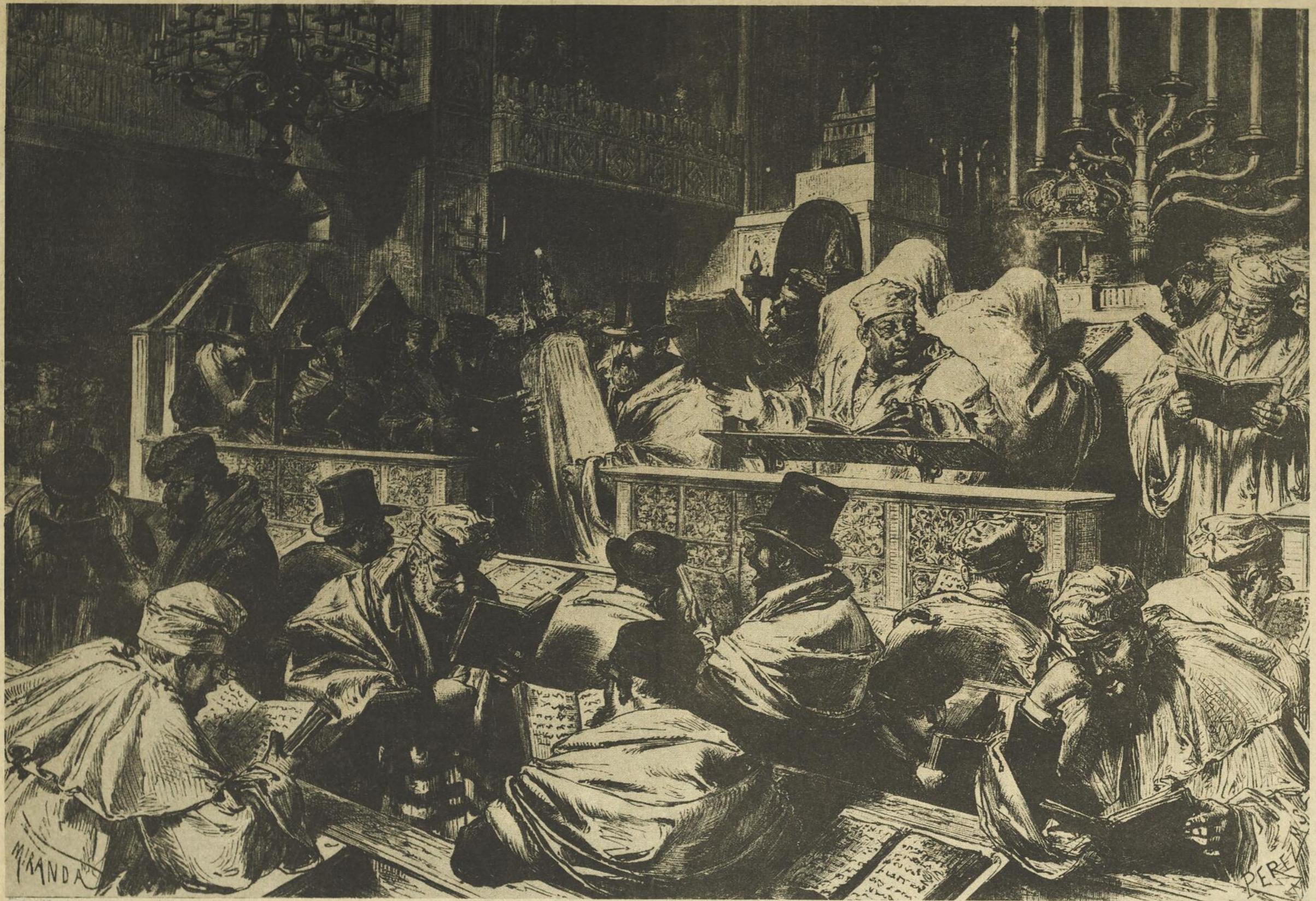
The above illustration appeared in the French Canadian Publication L'Opinion Publique, 1874

REÇU LE 9 SEP. 1975 BIBLIOTHÈQUE NATIONALE DU QUÉBEC