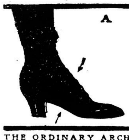
THE ORDINARY ARCH