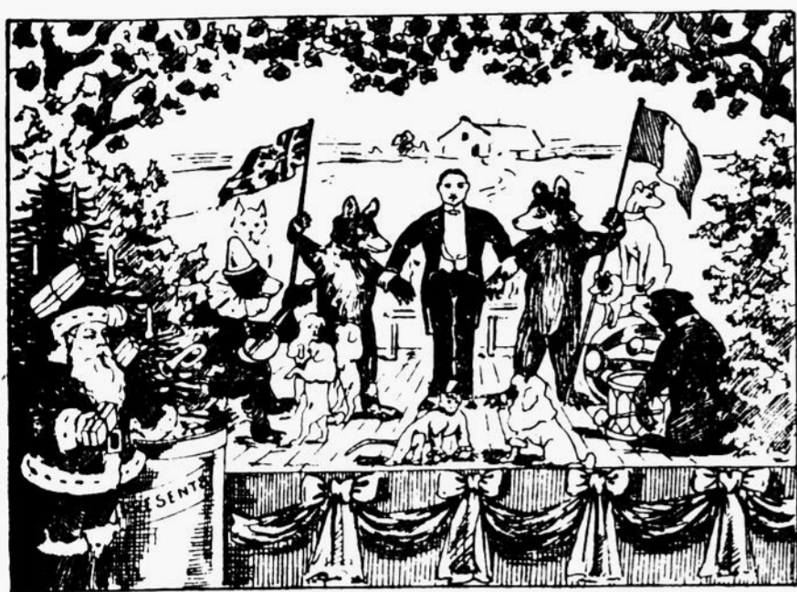
Thousands visit Santa Claus and his loyal live performing bears, dogs, and monkeys all in roars of laughter at their annual antics.