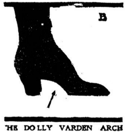
THE DOLLY VARDEN ARCH