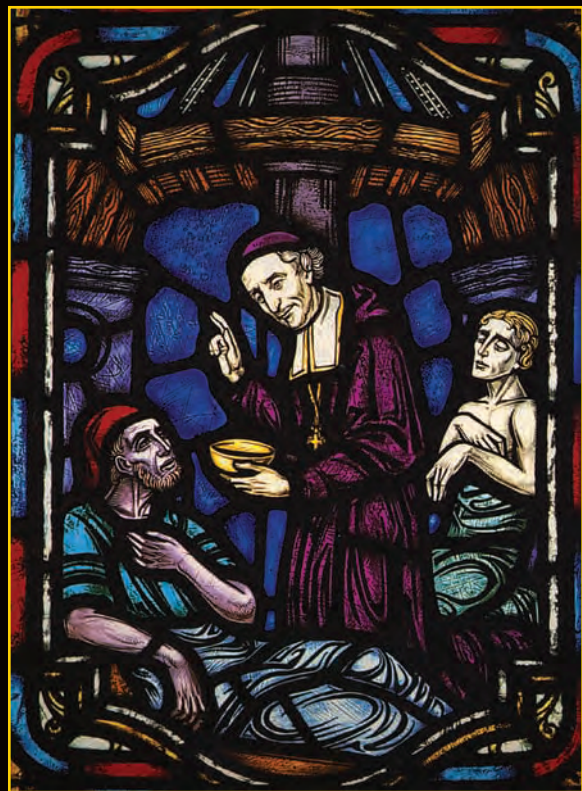
Blessed François de Laval first bishop of Québec 1623-1708