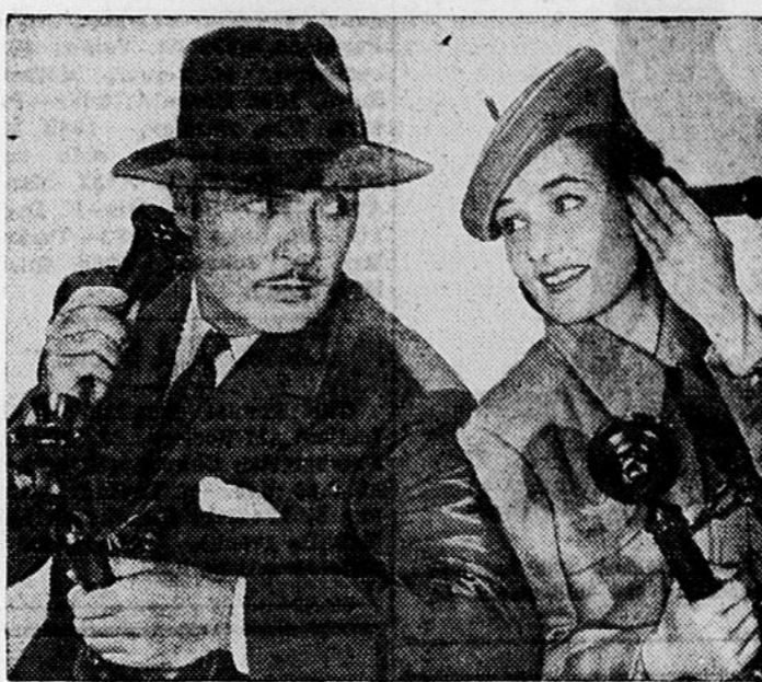
George Brent and Brenda Marshall are the stars of Warner Bros.' amusing film of newspaper life, "You Can't Escape Forever..."