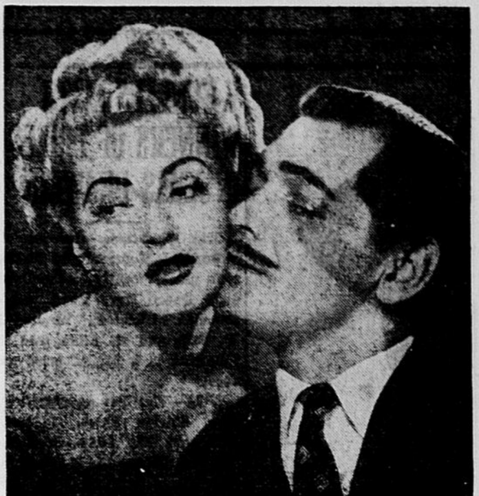
Clark Gable and Lana Turner, after their smash success in "Honky Tonk," are together again in M-G-M's "Somewhere I'll Find You..."