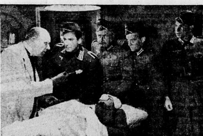
Errol Flynn, Alan Hale, Arthur Kennedy and Ronald Reagan in a scene from the thrilling and exciting film "Desperate Journey..."