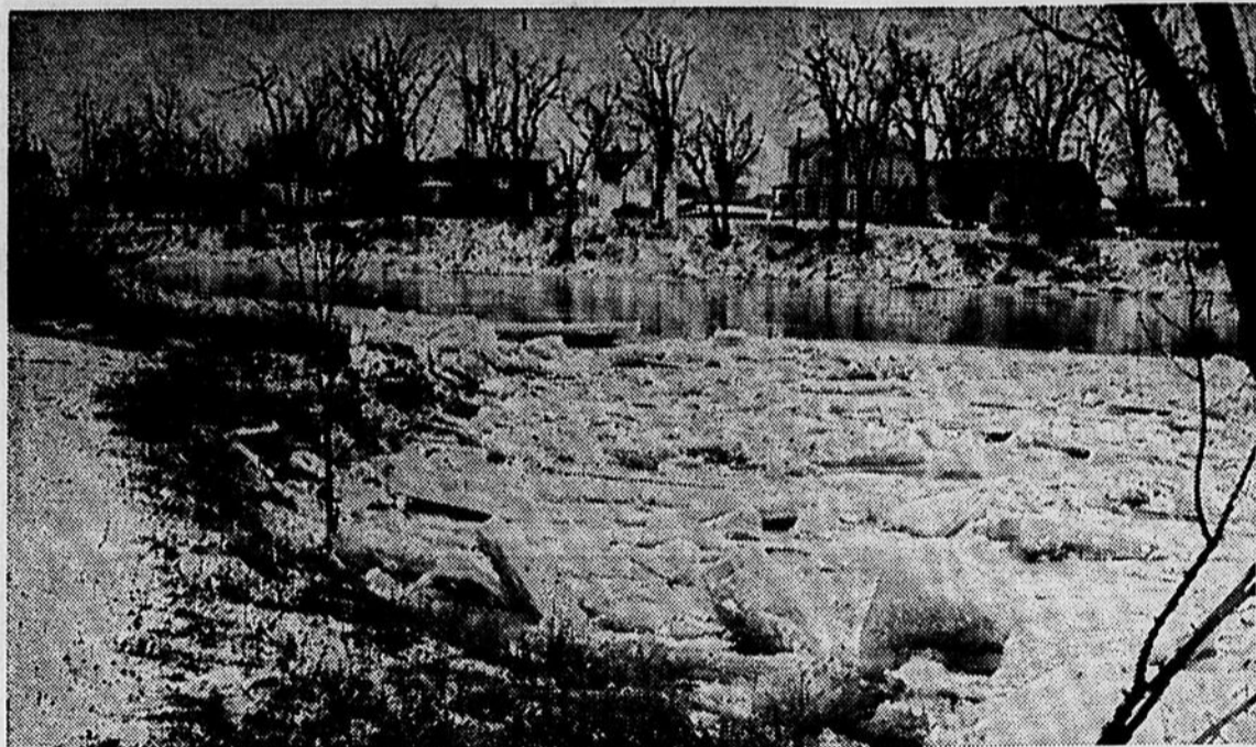
The big question concerning the Chateauguy River now is will the ice disappear calmly into Lake St. Louis . . . when and if Lake St. Louis itself ever becomes ice free . . . or will there be flooding again despite the channel that has been made? Flooding last year was quite considerable. It all depends on what the weather has in store for us.