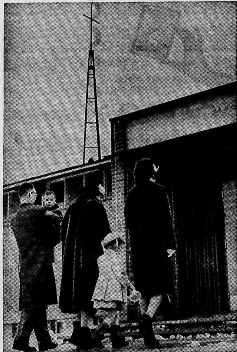
EASTER : In churches throughout Chateauguay this scene was repeated as families attended special Easter services.