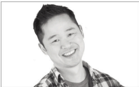
By Danny Seo

If you park your car in a garage — at home or in an underground structure — keep your windows rolled up. Closed parking structures have poor ventilation, so fertilizers, paint fumes and other chemicals can build up inside. Since there's nowhere to vent, these chemicals can contaminate the interior of your car if your windows are down. When you are home, leave the garage door open to ventilate, and when you do drive, roll down the windows and let it vent out for at least 1 mile of driving.