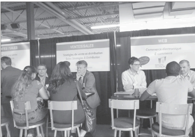
Speedcoaching connects local entrepreneurs with experienced business leaders in order to guide and help them. The 11th annual session took place at Bishop's University Wednesday.