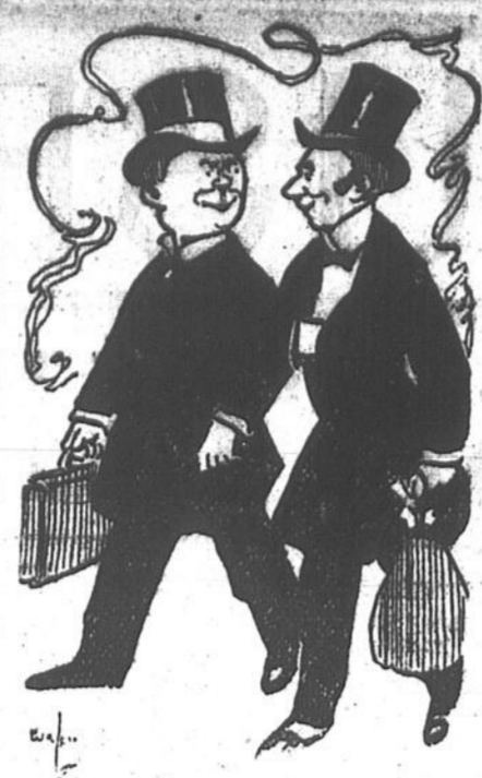
AN EYE TO BUSINESS. Young Doctor—I prescribed for my first patient yesterday.

Men who see into their neighbours are apt to be contemptuous, but men who see through them find something very behind every human soul which it is not for them to sneer out of the world's God's manifold universe.