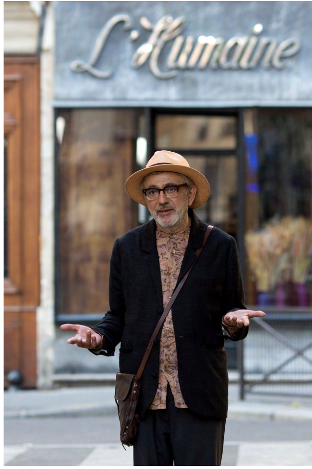
It Must Be Heaven by Elia Suleiman Coproduction France, Québec, Germany, Turkey