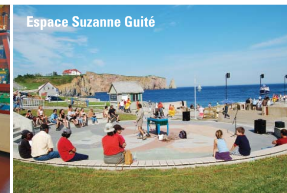
Espace Suzanne Guité