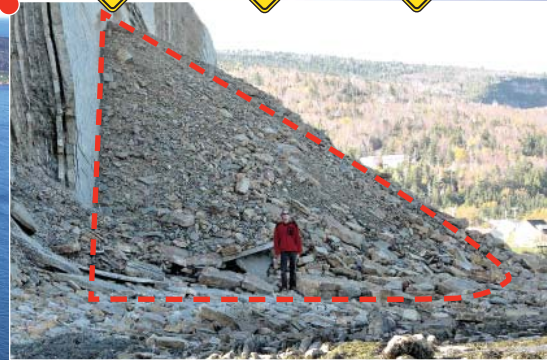
Rock slide, October 2008