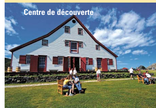
Centre de découverte