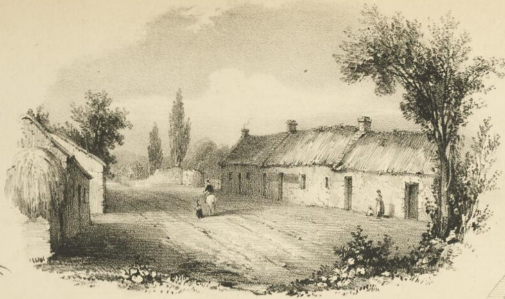
BIRTH PLACE OF BURNS.