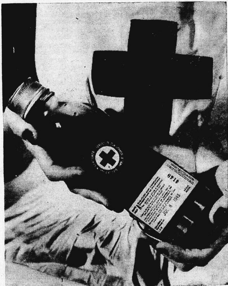
Life-Saver — When voluntary donors contribute to the free blood transfusion service of Canadian Red Cross, their gift blood is put in a bottle like this — the bottle that has already saved thousands of Canadian lives. In 25 hospitals in Montreal, Westmount and surrounding districts, this bottle has become a familiar object. Later it will appear in hospitals, large and small, throughout Quebec as it has already in some other provinces, thanks to men and women between the ages of 18 and 65 who support free transfusions by giving a twentieth of their blood twice a year. The bottle label reads, "Gift of a Volunteer Donor," repeated in French.