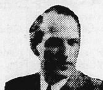
LOUIS BOURDON prominent radio singer and master of ceremonies