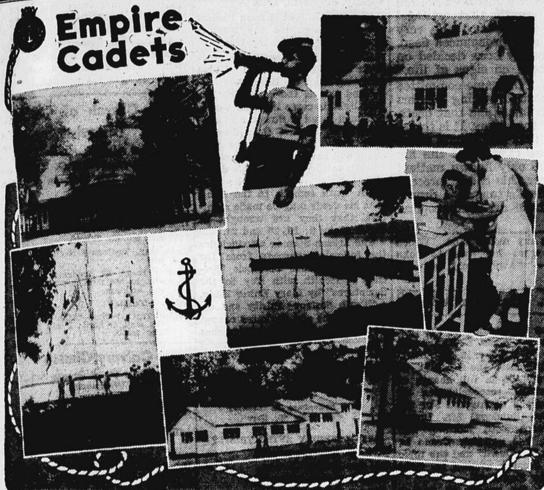
Shown above are typical scenes at Camp Ewing, Que., the Royal Canadian Sea Cadets camp near Montreal where 80 selected Canadian Sea Cadets will play host to 78 cadets from the United Kingdom, Australia, New Zealand and Sweden between July 26 and Aug. 5. Top left: Ship's Office, Wardroom and Officers Quarters; lower left: Signals Class; centre: whalers at the jetty; lower centre: the Mess Hall seats 300 perpetually hungry Sea Cadets; top right: Recreation Hall; centre right: professional attention to small hurts by the Nursing Sister; lower right: airy dormitories make for sound sleep.

Many people frequently use gasoline or lighter fluid to remove spots from clothing or as a general cleanser for machinery. But gasoline is one of the most dangerous fluids that can be used around the home. It evaporates readily and the poisonous gas it