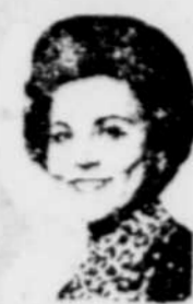
By Ann Landers