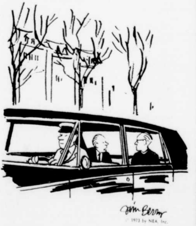
"If we would have had to listen to one more of Dr. Kissinger's stories about the swinging chicks he dates, I would have left Paris!"