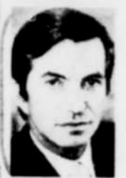
DR. LAWRENCE E. LAMB A Vitamin Deficiency

Planning a wedding? What's right? What's wrong? Ann Landers' completely new "The Bride's Guide" will relieve your anxiety. To receive a copy, send a dollar bill, plus a longself-addressed, stamped envelope (16 cents postage) to Ann Landers, Box 3346, Chicago, Ill. 60654.