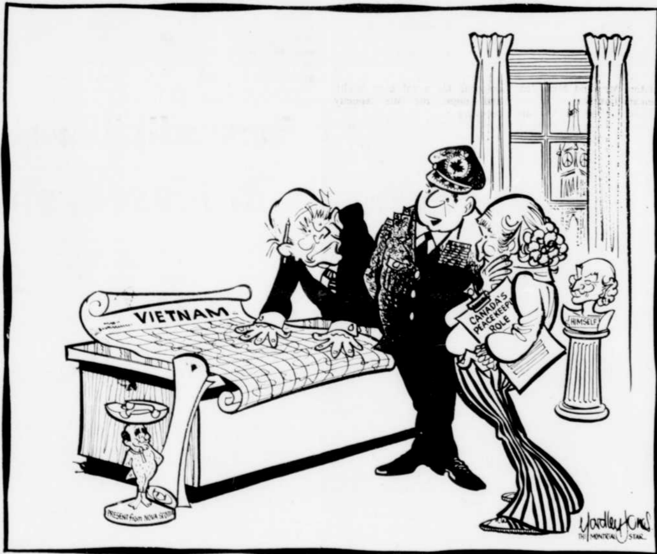
"Well, getting in appears simple enough — let's make sure we know how to get out..."

The Great Society did not lead us into eudaimonia. It led us into frustration — and to the lowest recorded confidence-vote in the basic institutions of this country since the birth of George Gallup. But: he was a patriot, who cared for his country, who was unsparing of himself, and who acquired at least a certain public dignity which lifted him from buffoonery, into tragedy. And he was the object of probably the greatest sustained vituperation in American political history. He paid a very high price for the office he discharged. And his detractors, as it happened are America's worst friends, if that was any consolation.