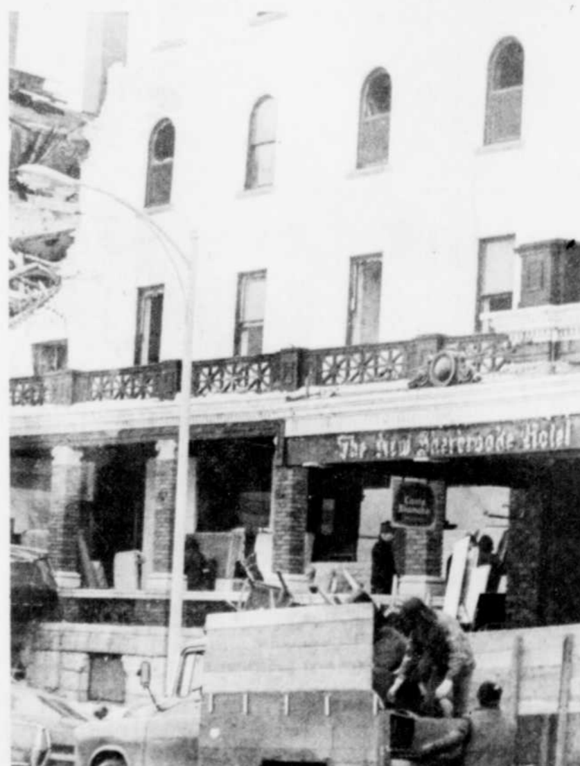
DEMOLITION STARTED — Work to demolish the ruins of the New Sherbrooke Hotel has started. Saturday a miniature auction was