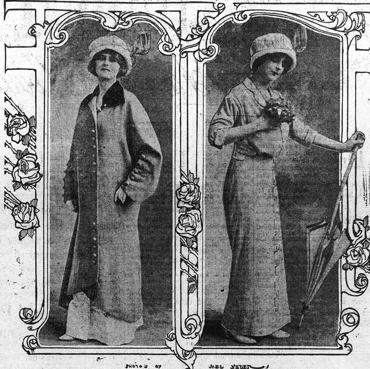
TURKISH TOWELLING FOR GOWNS AND COATS. This gown of gray towelling or terry cloth, which is shown, is trimmed with strappings of white linen and big white pearl buttons. It is a particularly smart and typical summer costume for beach wear. The latest in motor coats is shown in the model of tan colored Bedford cord with a lining of white satin. The absence of revers, the straight front opening and oddly cut sleeve are all very modish features.