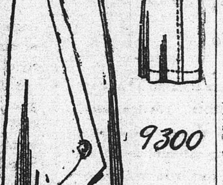
9300—LADIES SKIRT (IN RAISED OR NORMAL WAISTLINE).