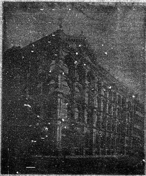
Montreal Building—Victoria Square