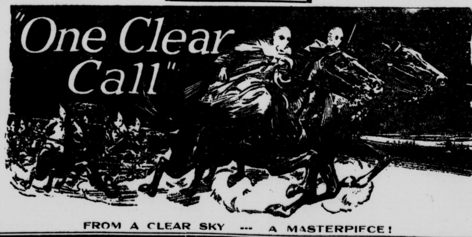
FROM A CLEAR SKY --- A MASTERPIECE!

Comedy and Weekly On Same Bill Usual Prices