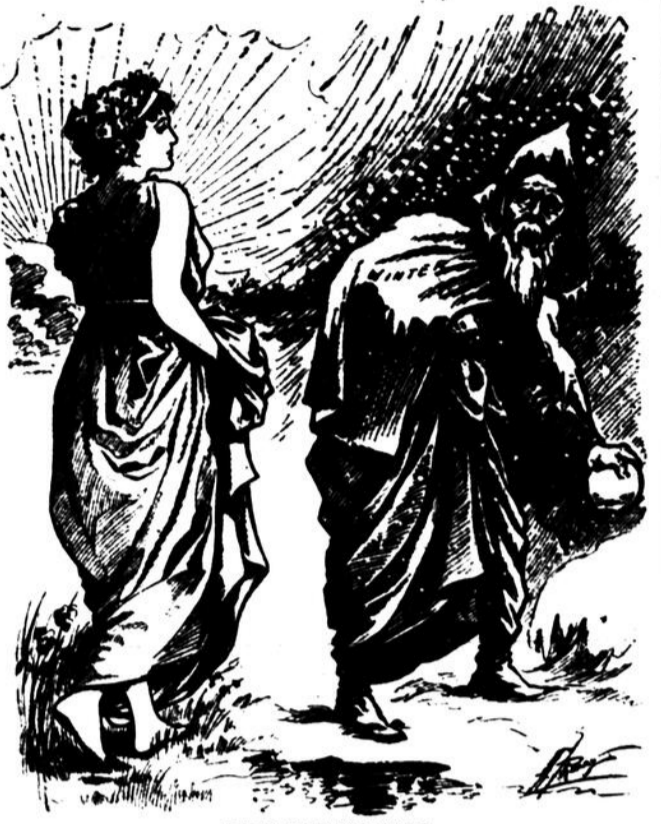
THE PARTING SHOT.

One of the Rothschilds said many years ago: "A bank that buys its own stock is doomed." The expression is not a weighty one and might readily have been spoken by a less eminent financier than a Rothschild.