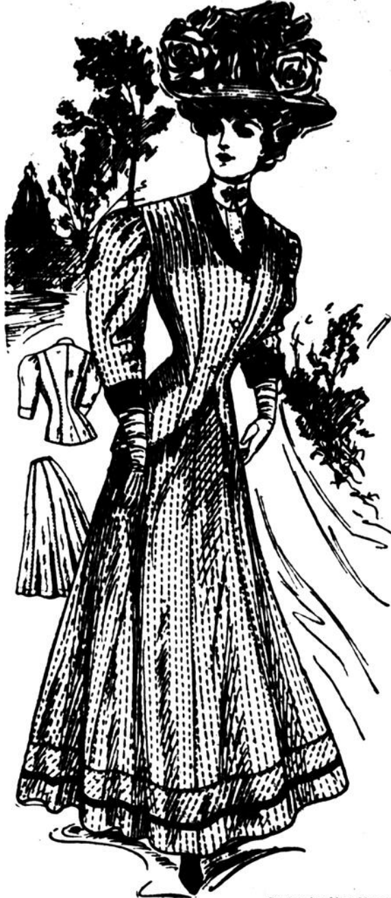
5765 Cutaway Coat. 5828 Seven Gored Skirt.

Separate Waists Still Regain. This season the separate waists are as regular in form and trimming as are the various dresses.