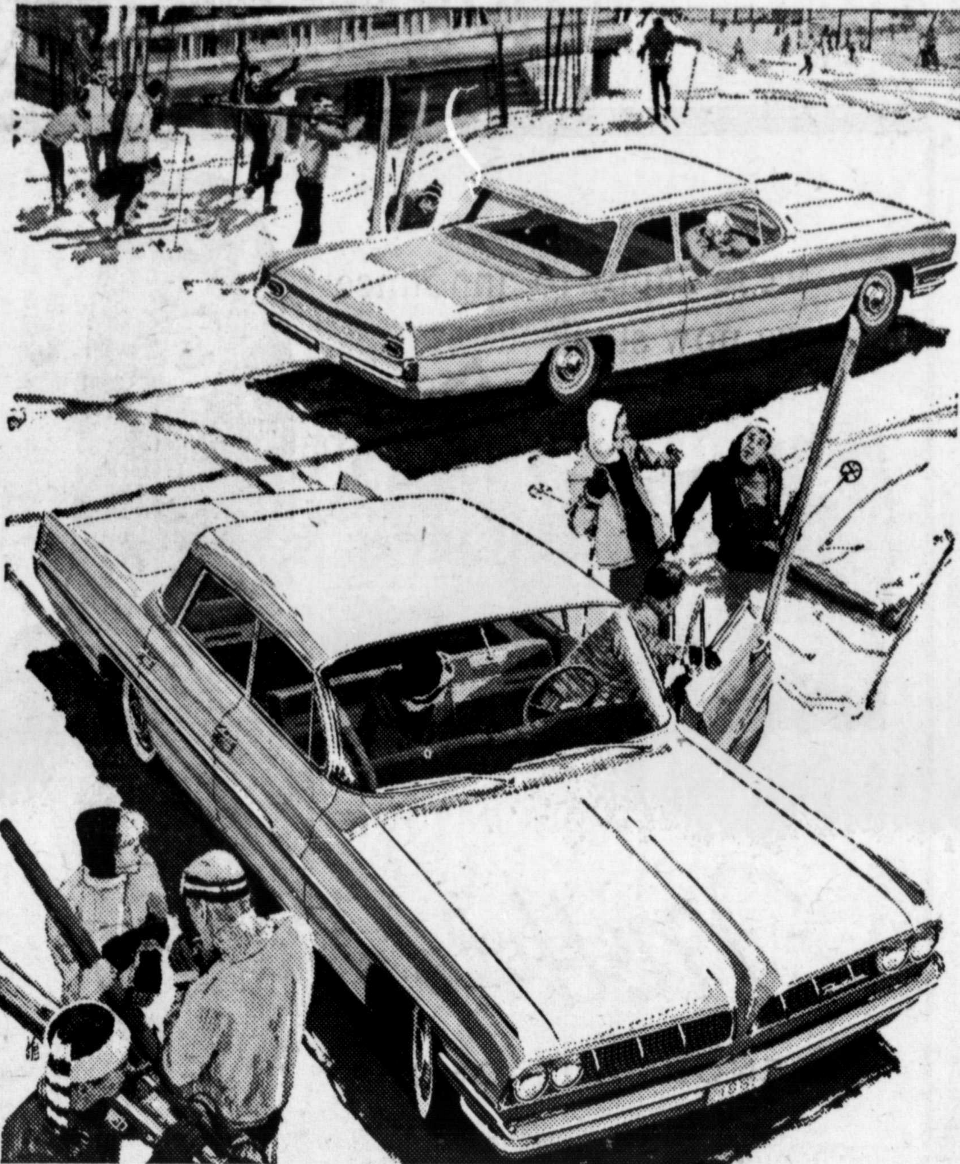
ABOVE Strato-Chief 2-Door Sedan BELOW Laurentian 4-Door Sport Sedan