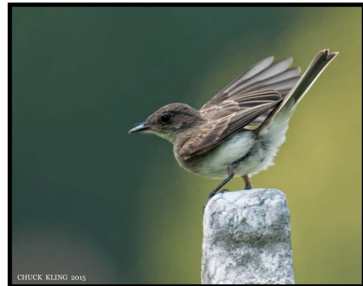
Eastern Phoebe © Chuck Kling 2015

ouest puis l'autoroute 30 (péage). Prendre l'autoroute 530 en direction de Salaberry de Valleyfield. Prendre la sortie 9, puis tourner à gauche sur la route Pie XII. Continuer sur la Route du Pont puis sur le Rang du 40. Tourner à droite sur la route 138 et suivre les directions vers Ormstown. Tourner à gauche sur la route 201 et continuer jusqu'à l'intersection avec le 3ème rang (indiqué rang Tullochgorum de l'autre côté). Tourner à droite sur le 3ème rang et y attendre le reste du groupe. Les déplacements se feront principalement en voiture. Le covoiturage est recommandé. Cette excursion permettra d'explorer certaines routes du Sud-Ouest du Québec, dans la région de Ormstown et Huntingdon. L'excursion débute tôt car certaines routes sont très achalandées et il peut être difficile d'y trouver un stationnement. À la recherche d'oiseaux forestiers et d'oiseaux d'espaces ouverts. Parmi les espèces susceptibles d'être rencontrées, notons le Viréo à gorge jaune, la Paruline à ailes dorées, le Bruant des champs, le Merlebleu de l'Est ainsi que d'autres passereaux plus communs. Demi-journée, avec possibilité de poursuivre jusqu'en début d'après-midi.