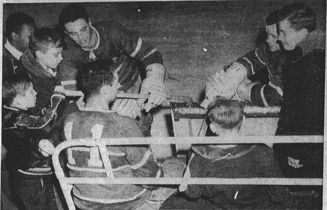
CANADA'S OUTSTANDING Athlete for 1956 Jean Béliveau, left talking to several Young Montrealers during a practice session at the Forum. On the right is NDG's Doug Harvey.

He will return Jan. 8 to direct Loyola in its first game against