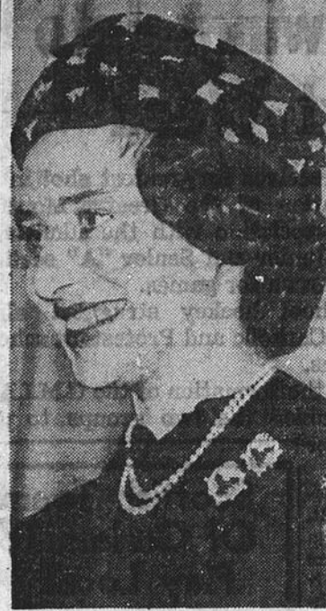
MARGARET MODELS BOUFFANT COIFFURE: Vivacious Princess Margaret is all aglow here during a visit to the Foundation hospital, Tooting Grove, London. The Princess' hairdo appears to be the new 'bouffant' coiffure currently popular.

Considerable research went on before the designers of Robert Stocks and Company Ltd., of Kirkaldy, finally began work on these towels, for the idea was to weave them as would have been done in the 17th century. As a tribute to the 20th century, they also show reproductions of the ship and the legend "Mayflower 1620". Red, blue, green and yellow have been chosen as the basic colours, and after the ship has left on its voyage, similar towels will be on sale in overseas markets.