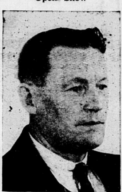
DONALD E. BLACK, M.P. Chateauguy-Huntingdon, who officially opened Ormstown Exhibition last night.