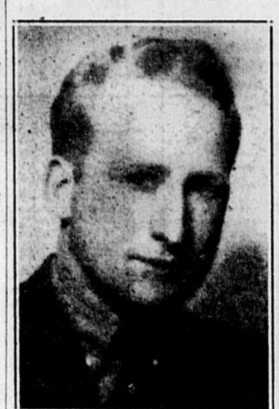
Member of the Parade Committee for Huntingdon Old Home Week, who will contribute much towards the excellence of some of the parade floats.