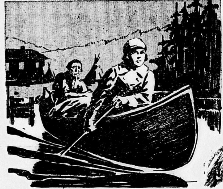
Ellen Mackay was crouching in the bow of a slender birch-bark canoe.