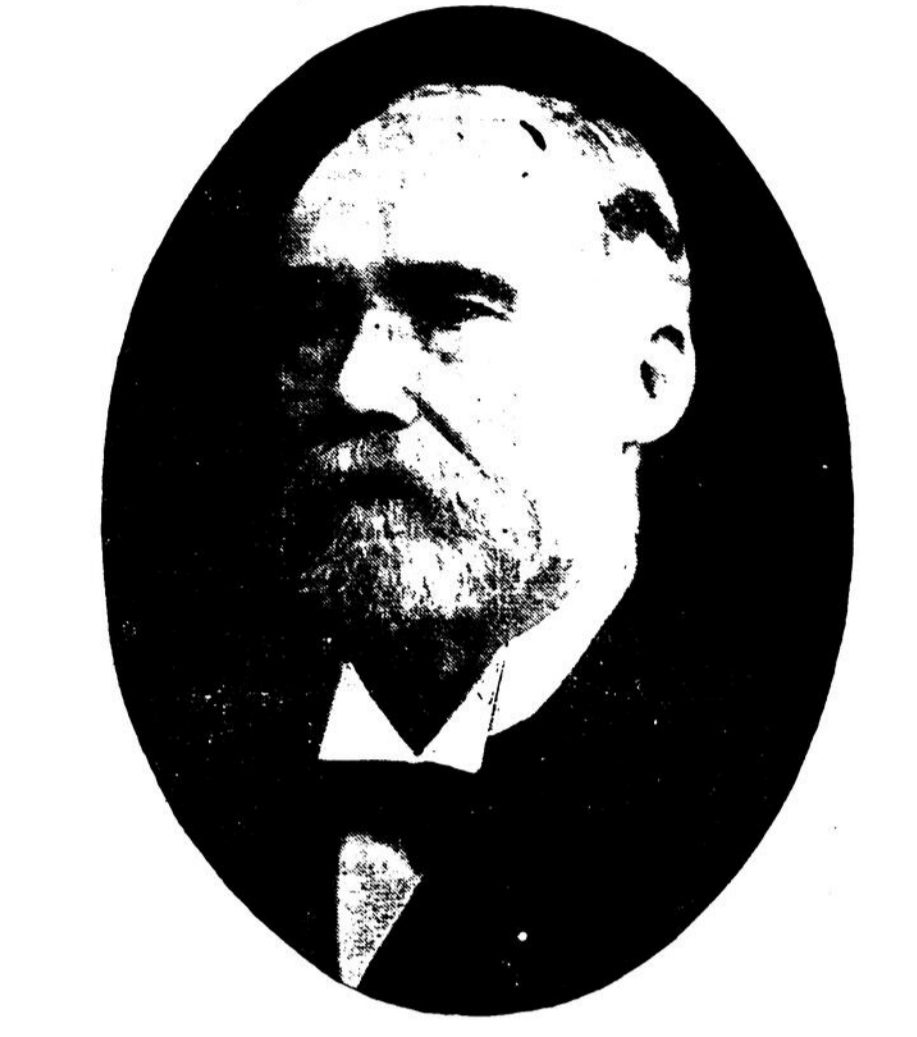
HON. GEO. W. ROSS, Liberal Premier of Ontario, Whose Government is Sustained by Yesterday's Elections.