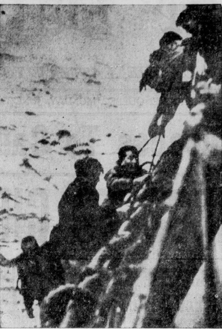
Up the side of the British destroyer "Beagle" go American sailors rescued off the French coast after their landing craft was sunk during the invasion of France. Fortunately, they were none the worse for their dunking in the Channel.