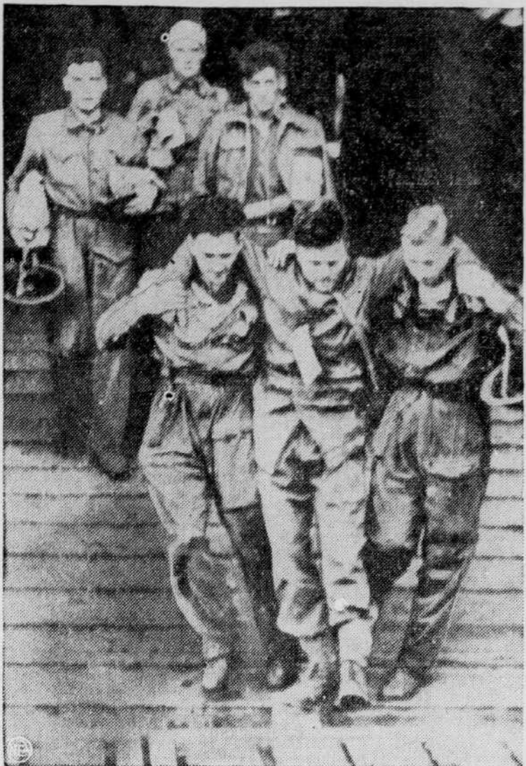
Wounded British soldiers, among the first to meet enemy fire when the Allies stormed the coast of France, are helped ashore from an LST transport at an unnamed British port.