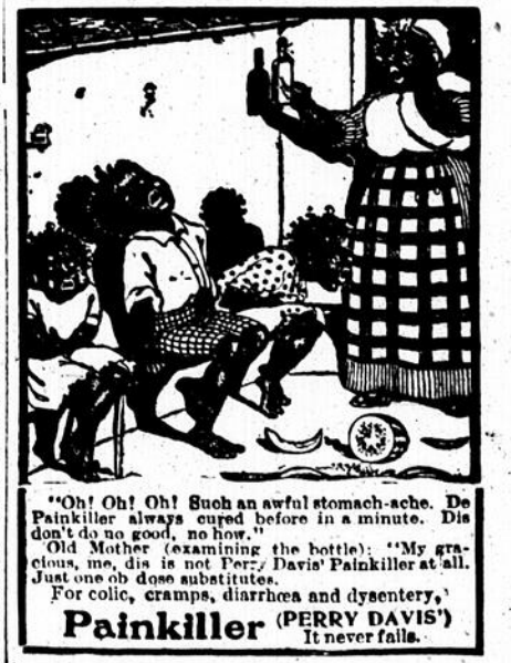
What Oh! Oh! Such an awful stomach-ache. Do Painkiller always cured before in a minute. Dis- tinctly the best. Get it at once. It is the only one that does not hurt. For colic, cramps, diarrhoea and dysentery, it is the only one that does not hurt. (PERRY DAVIS) It never fails.

Italian Warehouse - - 207, 209, 211 St. James St. Whisky Cocktails in quart bottles. Manhattan Cocktails in quart bottles. Martin Cocktails in quart bottles.