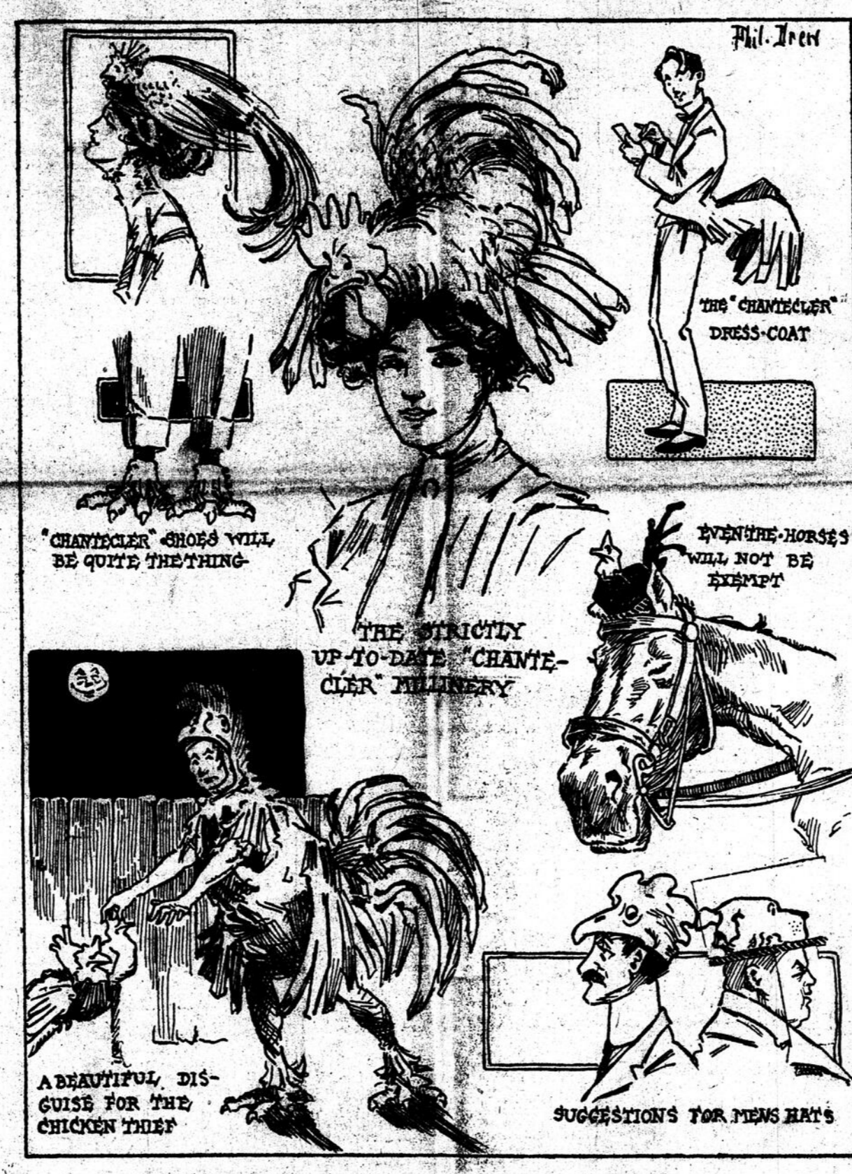
WHEN THE 'CHANTECLER' CRAZE STRIKES MONTREAL. TUESDAY, MARCH 15TH, SPRING OPENING DAY.