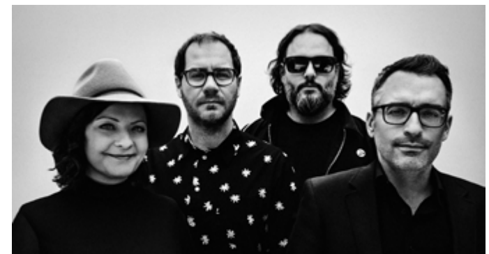
Les Cowboys Fringants