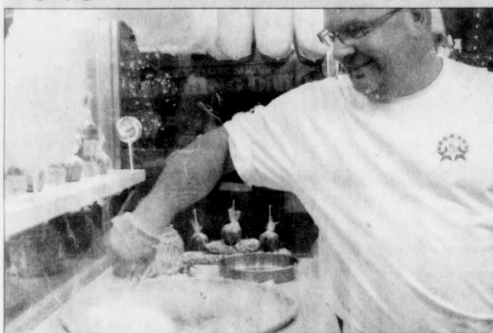
One of the vendors gets cotton candy ready for a customer's order.