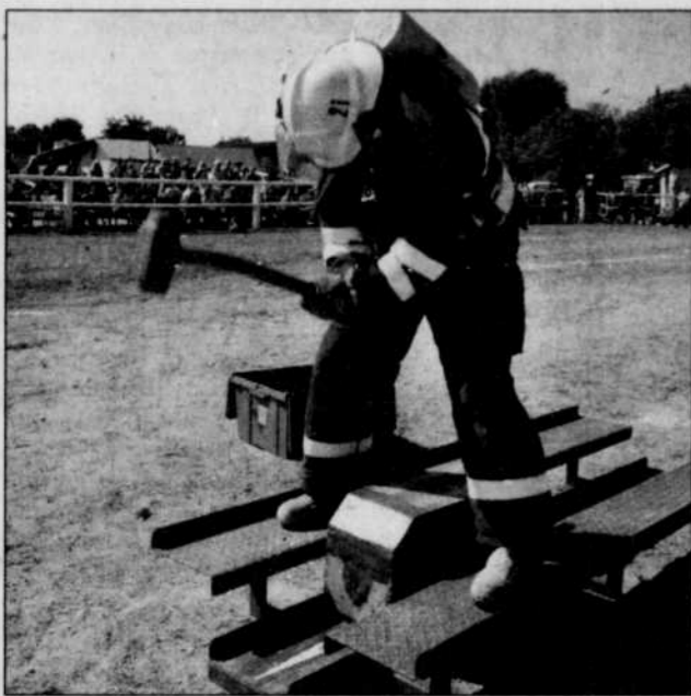
Firefighters participate in a grueling four member tag-team effort at the Firefighter challenge held at the fairgrounds on Monday.