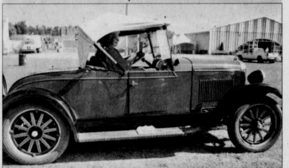
Vintage cars and trucks were admired by curious onlookers and car buffs alike at the Shawville Fair Antique Car and Truck Show on Monday.