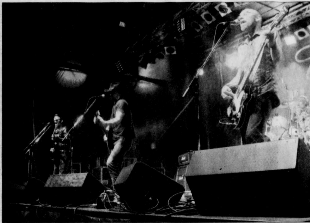
This year's headliners The Road Hammers performed for thousands of fans on Sunday evening.

A few fights also occurred in the beer tent but no charges were filed.