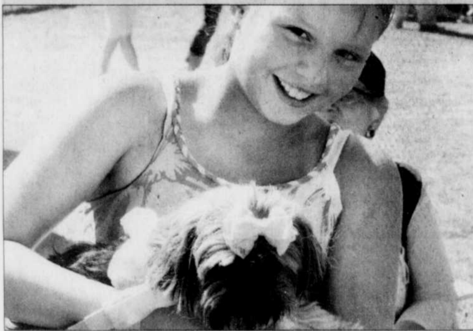
A Shawville Fair goer poses with her dog before the annual pet show at the 153rd Shawville Fair.