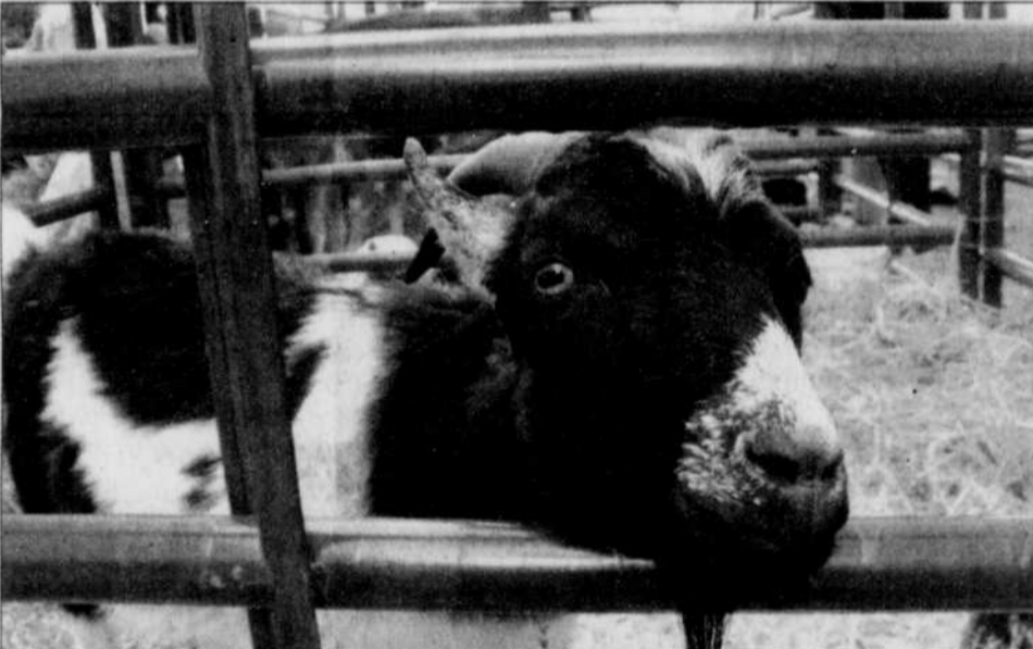
A goat peers his head through the fence in the agricultural tent on Sunday as people walk by and pet some of the animals on display. Throughout the tent various local businesses were represented.