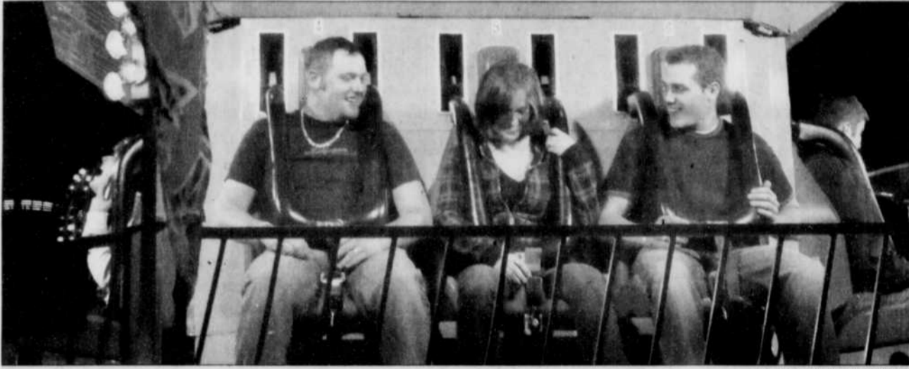
Le manège était très populaire à l'Expo 2009 de Shawville.