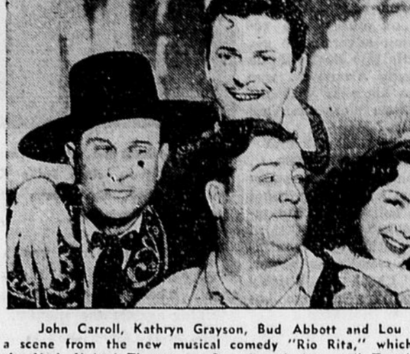
John Carroll, Kathryn Grayson, Bud Abbott and Lou Costello in a scene from the new musical comedy "Rio Rita," which opens at the York United Theatre on Saturday playing until Tuesday night.