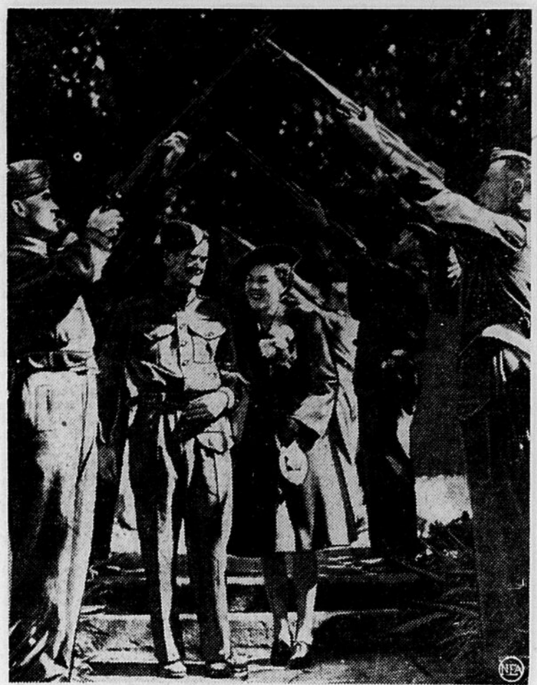
Elaborate wedding gowns are rare in England these days. For the glamor touch, soldiers' brides have to be content with the traditional arch of swords or rifles.

The "five-and-ten" chain stores have long since given up their "household" counters. On the other hand, you can still buy brooms, dishcloths and mops, but these are about three times dear-