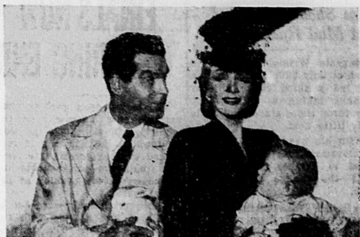
Fred MacMurray and Marlene Dietrich in a scene from "The Lady Is Willing," which opens at the Monkland United Theatre on Sunday playing until Tuesday night.