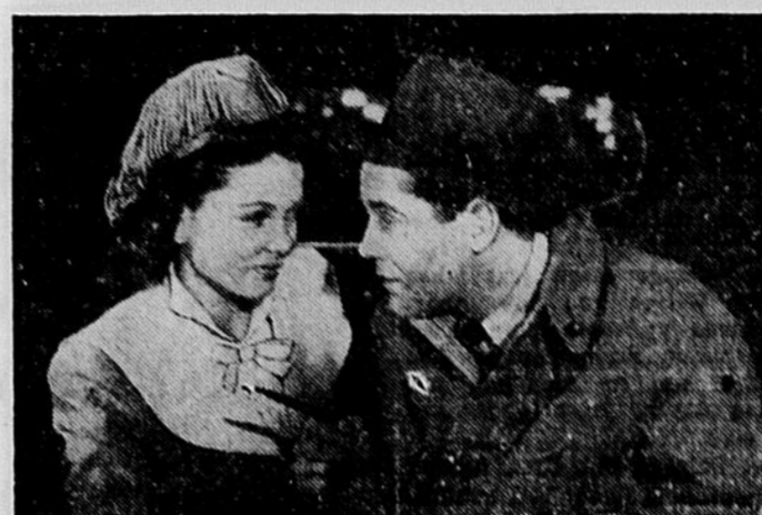
Henry Fonda is nuts about Gene Tierney in "Rings On Her Fingers," the hilarious new comedy which opens at the Westmount United Theatre on Sunday playing until Tuesday night. They keep 'em laughing with their loving, and are ably supported by that outstanding character actor, Laird Cregar, and a cast of favorites.