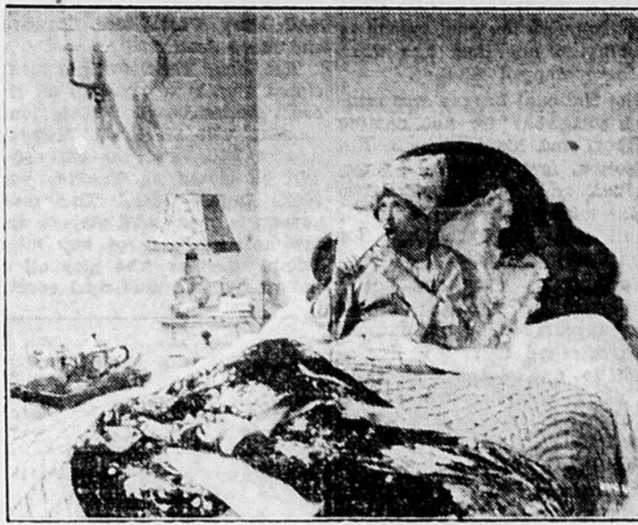
George Formby, the Lancashire Lad with the grin and the famous banjo, as Gigi Vannetti, the South American tenor, in his new (and best) comedy "South American George" which will play for a second week at the Snowdon Theatre, commencing Sunday, August 9th.