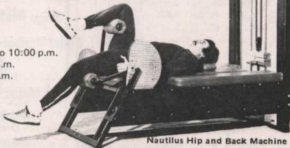
Nautilus Hip and Back Machine

Mon. to Fri. - 10:00 a.m. to 10:00 p.m. Sat. - 10:00 a.m. to 6:00 p.m. Sun. - 1:00 p.m. to 5:00 p.m.