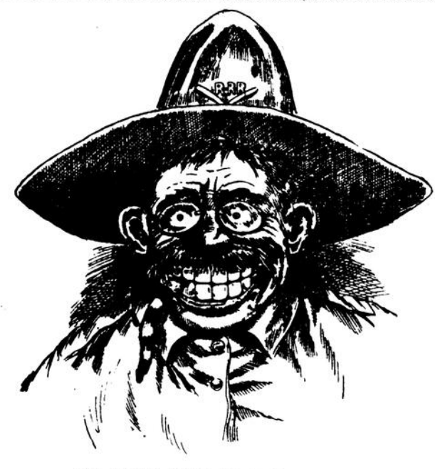
THE ROUGH RIDER SWALLOWS THE TIGER.

POLICY OF EXPANSION IS POPULAR WITH AMERICANS.