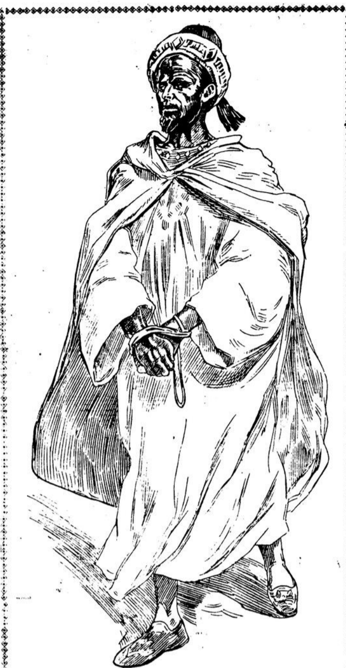
FRANCE CAPTURES SAMORY.

The knout-wielder, however, is chosen for the deed, for to these inhuman strokes, which are inflicted in trust houses here, it is in their power to inflict only light punishment upon the condemned, to make him a cripple for the rest of his days, or to send him to his grave on the spot, and the officials nevertheless it necessary to put any restraint on these blows.