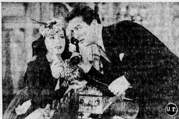
Gail Patrick and Ray Milland appear in a scene from the outstanding comedy feature, "The Doctor Takes A Wife," in which Loretta Young has the featured feminine role. The film is now playing at the Monkland United Theatre until Saturday night.