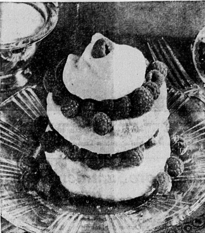
A modern dessert with old-fashioned flavor—raspberry shortcake made with rich biscuits and blanketed with country cream.

Grandma Liked Raspberry Cooler — And So Will You