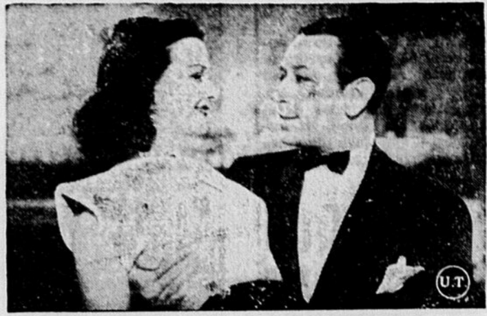
It's Joan Bennett's alluring beauty which captivates George Raft and starts an exciting romance in Walter Wanger's "The House Across the Bay," which is now playing at the York United Theatre until Friday night.