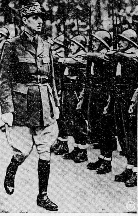
POLISH who do not accept the French surrender as final continuo, as allies of British, the struggle against Nazis. They are led by Gen. Charles de Gaulle, shown above reviewing some of French Volunteer Legion in London.