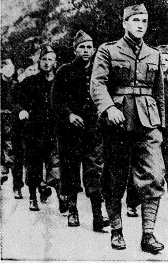
CZECHS, like these pictured in camp in northern England, have not "ceased fire" on the German which swallowed their homeland. With France's Seventh Army until its recent surrender, this Czech Legion now fights with Britain.