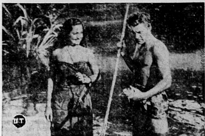
Lovely Dorothy Lamour and Robert Preston in a scene from the romantic adventure "Typhoon," entirely in Technicolor, which is now playing at the Westmount United Theatre until Saturday night.