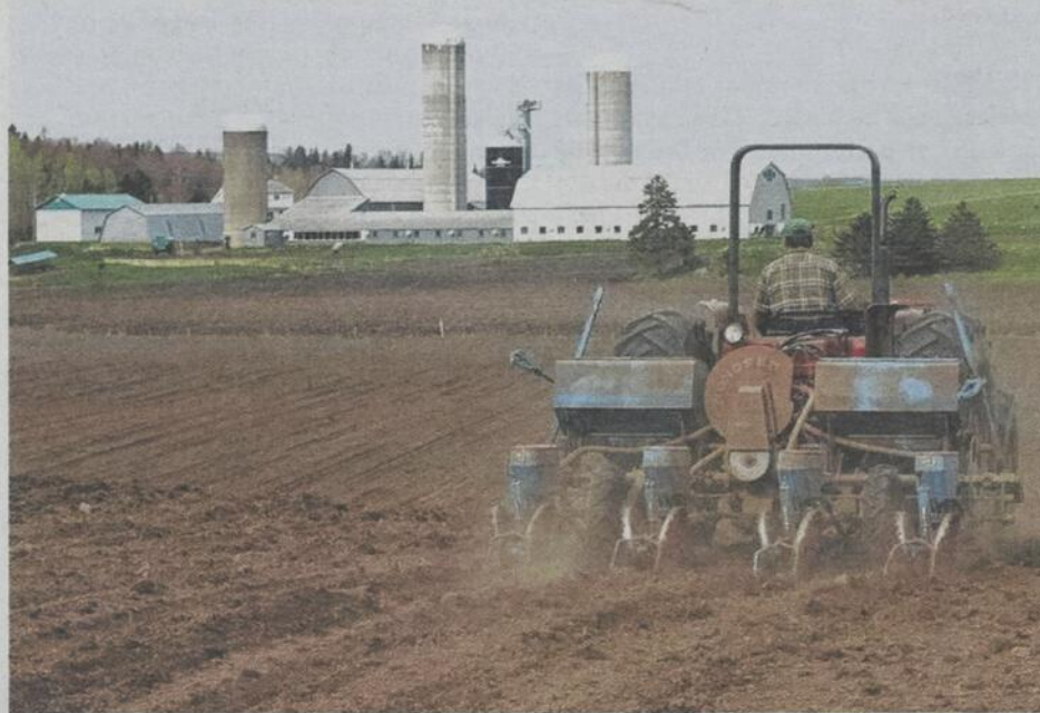
English speaking agricultural producers will be able to access training more easily.