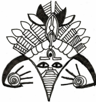
The Curretaras's Coat of Arms 6

looks up to it, smiling. A few moments later, the sorcerer turns around and with an alert step he walks into his central library facing his magic table in the centre of the room. He picks up an old book. It is his ancestors' grimoire. The leather on the front cover bears the Curretaras coat of arms. The leather shows frequent manipulations.