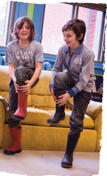
BODY BEATS WORKSHOP

This workshop is designed so that children can experience a new way of composing music. First, they will imagine the sounds and noises of provided comic-strip images, such as Charlie Brown or Tintin . They will then create a soundtrack for their own comic strips and draw them into the score.