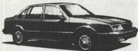
Chrysler Le Baron GTS 1985

BEST BUILT, BEST BACKED AND BEST PRICED!