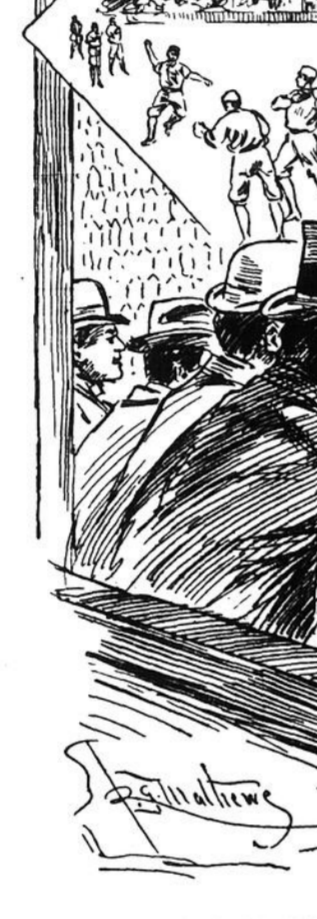
OPENING OF THE MONTREAL BASEBALL GROUNDS—VIEW OF THE FIELD FROM THE STAND.

Hunting the Buffalo is enjoyable sport for habitués. McDermott's decisions were all right. Montreal's outfield looks a shade faster than any other similar lot in the league.