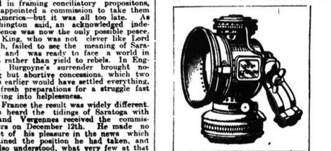
Made on principle of locomotive head light. Burns ordinary coal oil. Will not blow out, or go out, and throws wider light.