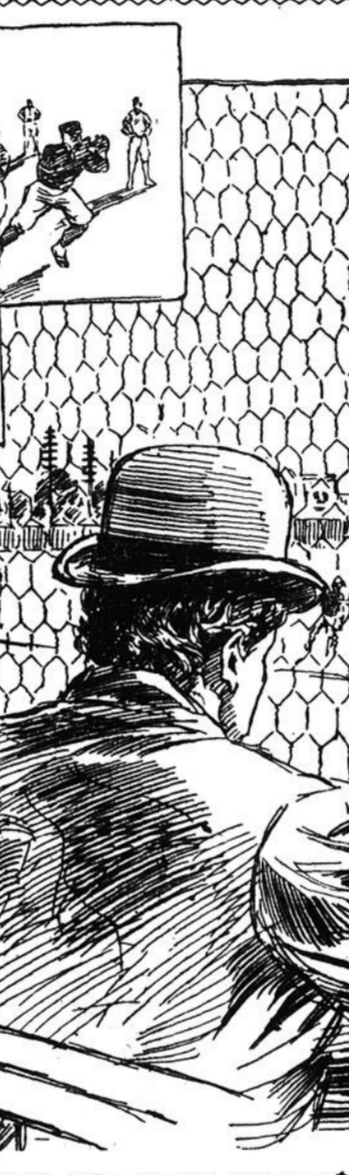
OPENING OF THE MONTREAL BASEBALL GROUNDS.