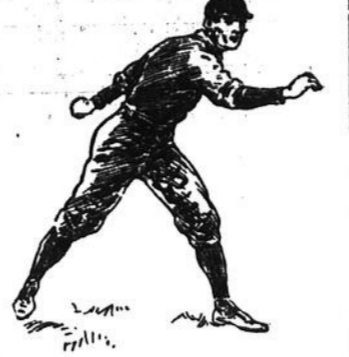
OPENING OF THE MONTREAL BASEBALL GROUNDS.

The bleachers do not like the color of Gilroy's hat, it looks too warm.