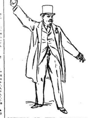
OPENING OF THE MONTREAL BASEBALL GROUNDS.

The crowd in attendance was most gratifying in every respect. It was fairly well sprinkled with ladies, many of whom while the extra pitcher, who assisted Montreal yesterday to make the official opening such a success, will not be seen again.