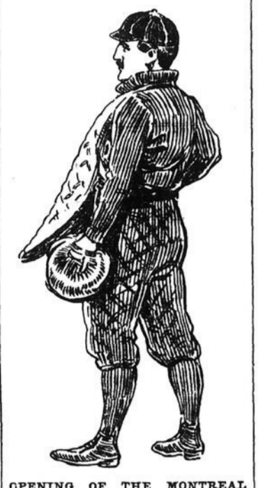
OPENING OF THE MONTREAL BASEBALL GROUNDS.

Yesterday, those who were lucky enough to receive an invitation, or to possess sufficient wealth to buy a ticket, were given a sample of that.