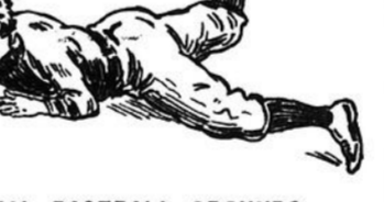
OPENING OF THE MONTREAL BASEBALL GROUNDS.