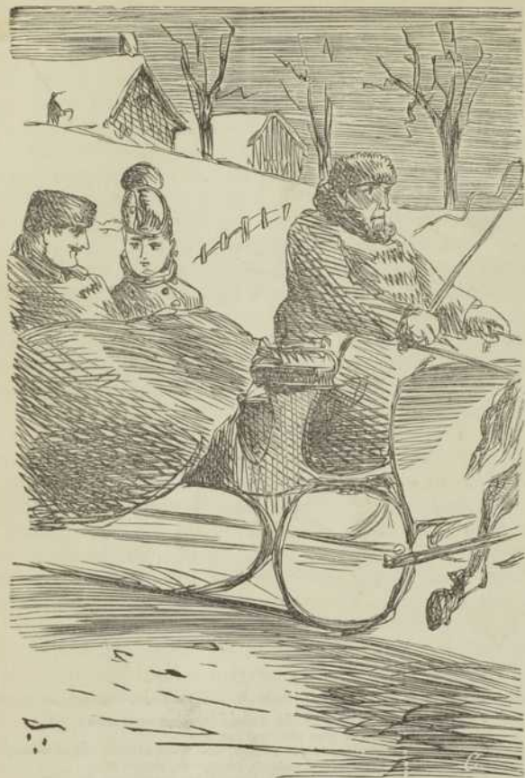
A REMINISCENCE OF MONTMORENCI.