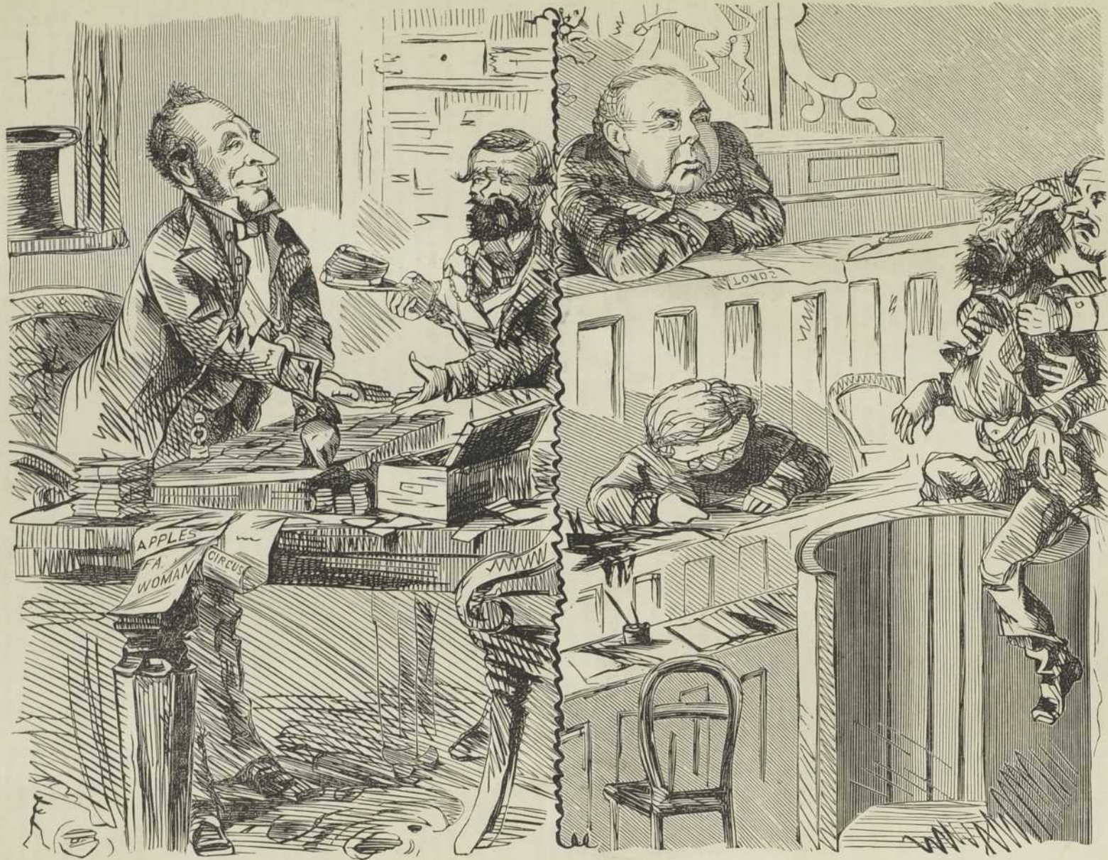
"A RATHER DECENT KIND OF A YANKEE."