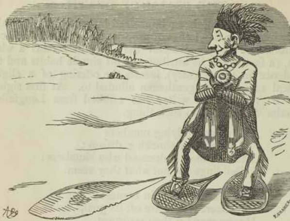
The Red Man recognises the well-known foot-mark of his Love.