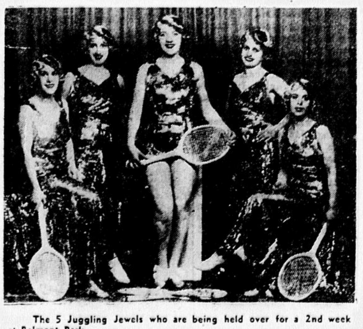
The 5 Juggling Jewels who are being held over for a 2nd week at Belmont Park.