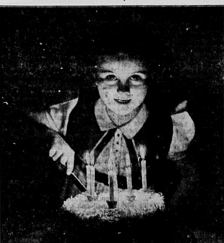
Easy to take—just a short time exposure with the camera on a firm support—this shot is part of a charming birthday series. Keep your camera busy on birthdays; they're fine for pictures.