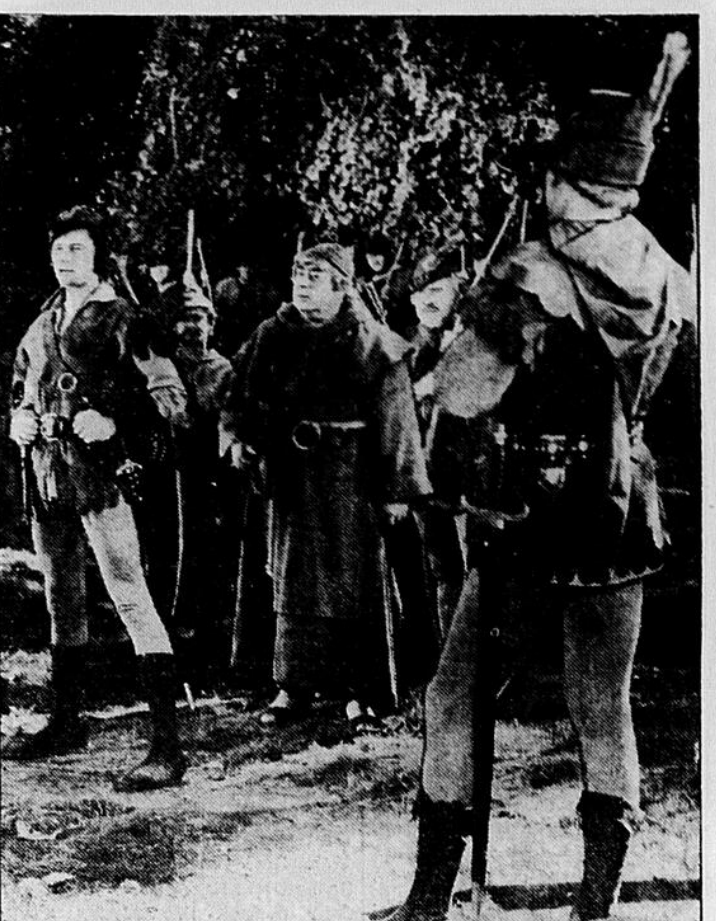
A scene from the technicolor film "The Adventures of Robin Hood" starring Errol Flynn, Olivia de Havilland and Basil Rathbone which opens Sunday at the Westmount United Theatre.