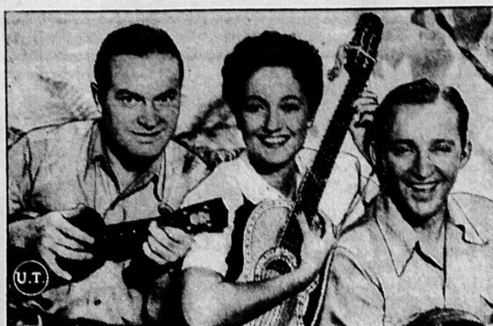
Bob Hope, Dorothy Lamour, Bing Crosby in a scene from the comedy "Road to Zanzibar" now showing at the Monkland United Theatre until Saturday.