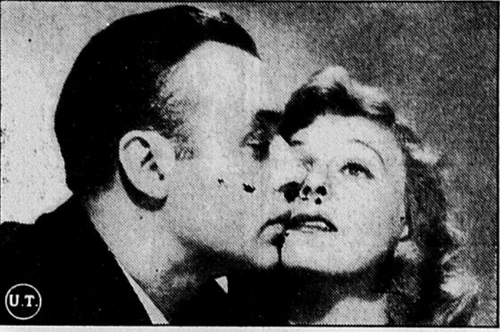
Charles Boyer and Margaret Sullivan, the co-stars of "Back Street," which is based on the sensational Fannie Hurst novel of the same name, this film opens at the York United Theatre on Saturday playing until Tuesday night.