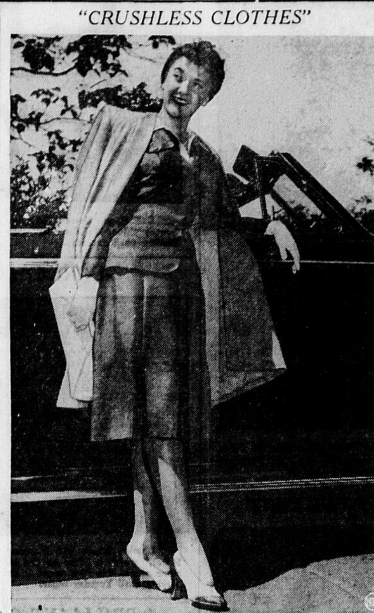
Ideal for a motor trip is this black shantung suit with fitted jacket and box-pleated skirt. It may be worn with easy-to-wash cotton blouses and gloves and a black turban. The lightweight topcoat is of natural rabbit's wool. This ensemble, plus a cotton suit and a variety of blouses, should see any motorist through a two weeks' holiday.