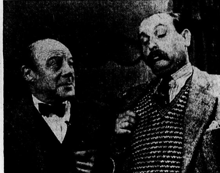
A scene from the film "Laburnum Grove" which is based on the famous record-breaking stage play by J. B. Priestley, now playing at the Snowdon United Theatre until Saturday night.