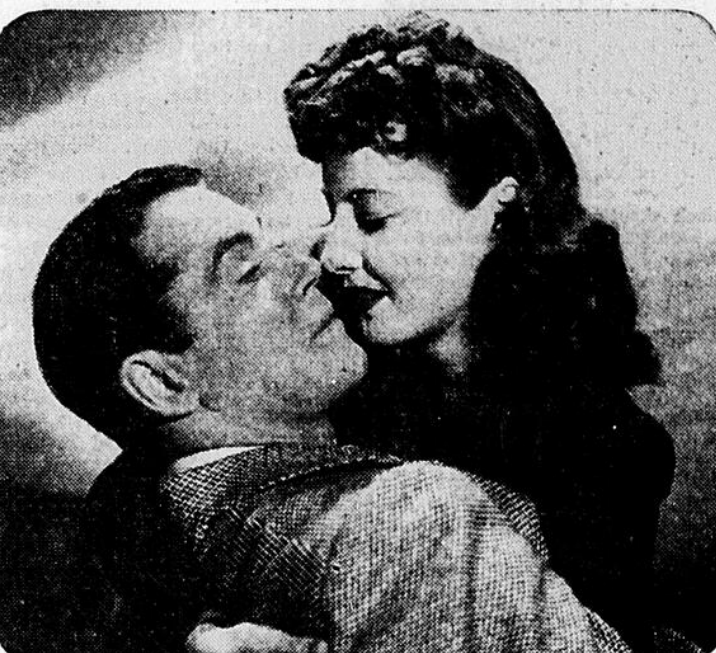
Henry Fonda and Barbara Stanwyck co-star in the delightful comedy romance, "The Lady Eve," which opens Saturday to run until Tuesday at Montreal's newest and most modern picture house, The Kent.

is a counterfeiter, has been for years and is not the least ashamed of it. He declares, too, that he may be picked up at any time and the rest of them be held suspect. The result is a riot of fun as the various rats try to escape the sinking Redfern ship. After twenty-four hours of terror, the Baxleys leave and the suitor has disappeared. Of course, Mrs. Redfern doesn't believe a word of it. Not even when an inspector from Scotland Yard comes to visit her husband, privately for a talk about his paper business. Its splendidly written and splendidly acted, by the principals at least. There's "Blonde Inspiration," a cartoon, and a newsreel to fill the bill. Barbara Stanwyck spent her early childhood in an orphan asylum.