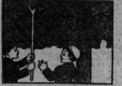
Hiding, creeping, sneaking. Everywhere about. Whispering in lowest tones. With never a laugh nor shout.

Taking gates from hinges. Hanging them in trees. Piling debris in the yards. High up as men's knees.