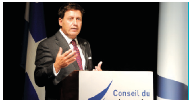
Transport Minister Pierre Moreau

In collaboration with the Quebec Transport Ministry, a forum on the transportation infrastructures was organized to discuss the overall state of the situation and the avenues of solution to look at so that Quebec can rely on a transportation network that contributes to everyone's prosperity.