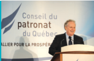
Quebec Premier Jean Charest

In April, the Council held its 42 nd general meeting, with Quebec premier Jean Charest in attendance. Before more than 200 business and employer association leaders, the organization launched the development of the first phase of its Prosperity Campaign aimed at