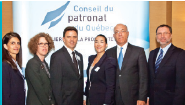
Luncheon on 2012 salary forecasts