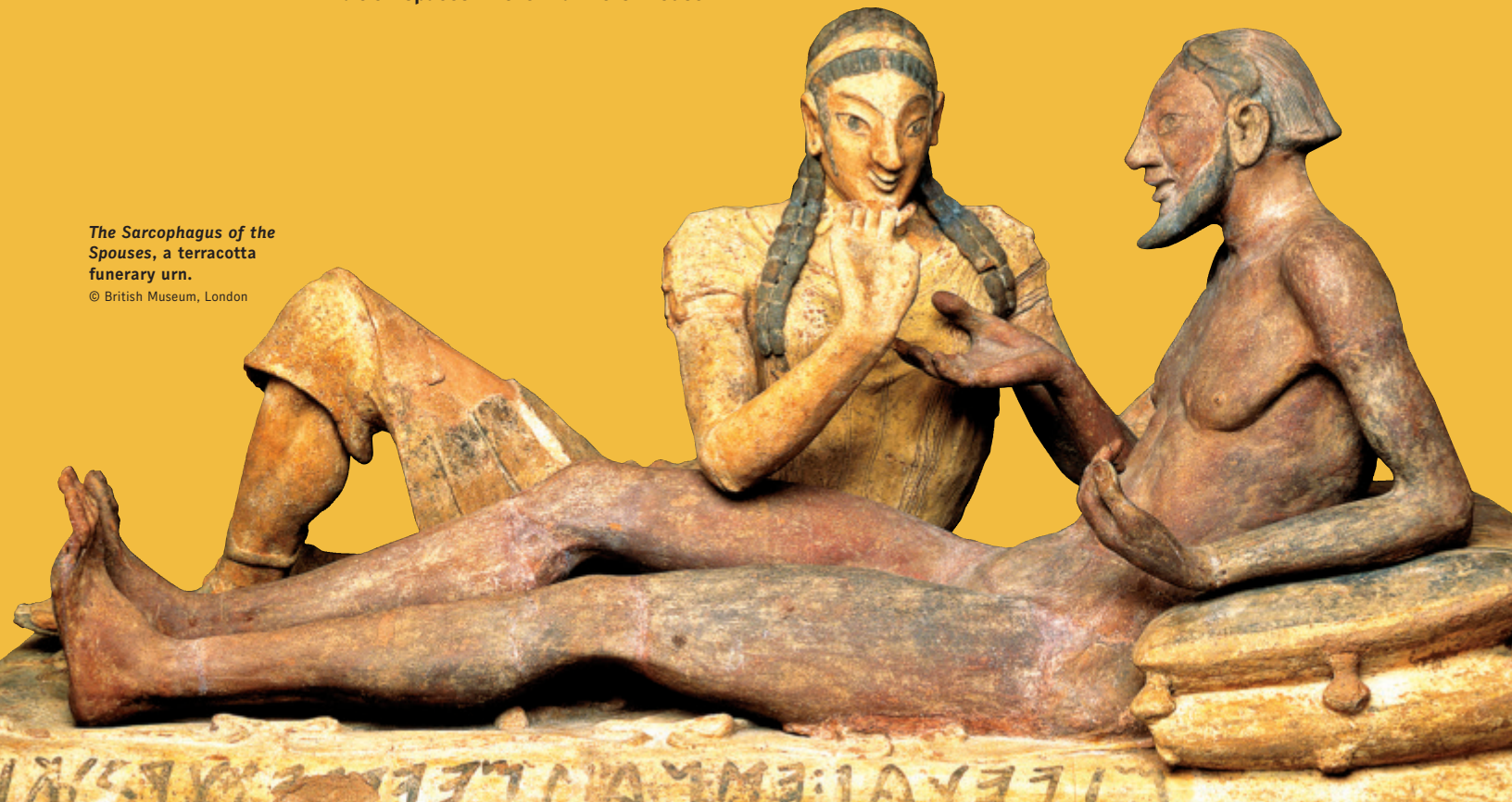
The Sarcophagus of the Spouses, a terracotta funerary urn.

A prestigious French-language publication, Les Étrusques – Civilisation de l'Italie ancienne , has been produced to accompany the temporary exhibition at the Museum. Visitors will be able to extend their enjoyment of the exhibition and take home some Etruscan splendours, with this resplendent 160-page publication featuring the main pieces from the exhibition. The scientific articles by veteran Etruscologists will also make it an indispensable reference for anyone interested in this exceptional civilization. Available at the Museum Gift shop.