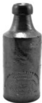
Beer bottle; St. Ann's Market, which became the first Parliament of the United Province of Canada (1844-1849)