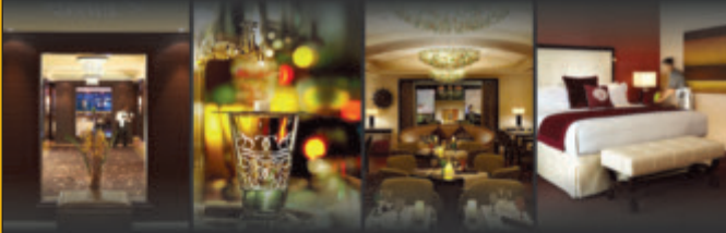
ELEGANT EXCITING ENRICHING TIMELESS

AT THE GATEWAY OF OLD MONTREAL CORNER OF SAINT ANTOINE AND SAINT PIERRE STREET, THE INTERCONTINENTAL MONTREAL SPARKLES WITH EXCITEMENT AND SOPHISTICATION A PERFECT BLEND OF OLD MONTREAL'S HISTORY AND A CONTEMPORARY DESIGN.