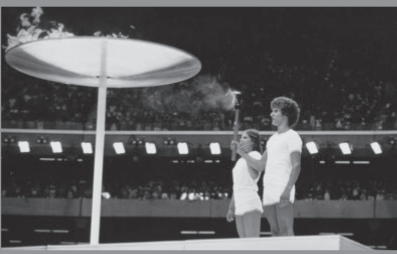
The Montréal 1976 Olympic Games were among the city's greatest moments in sports.

As part of the festivities surrounding Pointe-à-Callière's 20th anniversary, the Montréal Faves contest was launched to decide on Montrealers' top picks in four categories: the 20 symbols that best represent Montréal, the city's 20 greatest moments in sports, the 20 songs that best evoke Montréal and the 20 films that best showcase Montréal. The first list of winners was compiled from the votes by thousands of visitors to the Museum website and Facebook page.