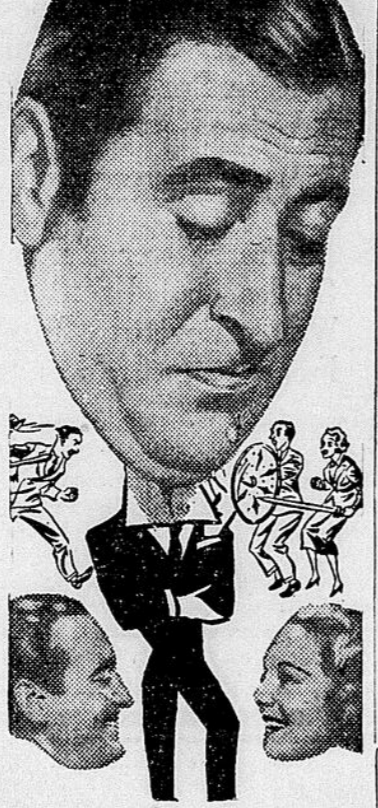
Arthur Treacher with inserts of Virginia Field and David Niven in the story of P. G. Wodehouse's uproarious people, "Thank You, Jeeves," opening a three day engagement at the Westmount United Theatre Sunday.

"Moon Magic" will be presented for one night only. Tickets will be on sale at the Willis Piano store shortly.