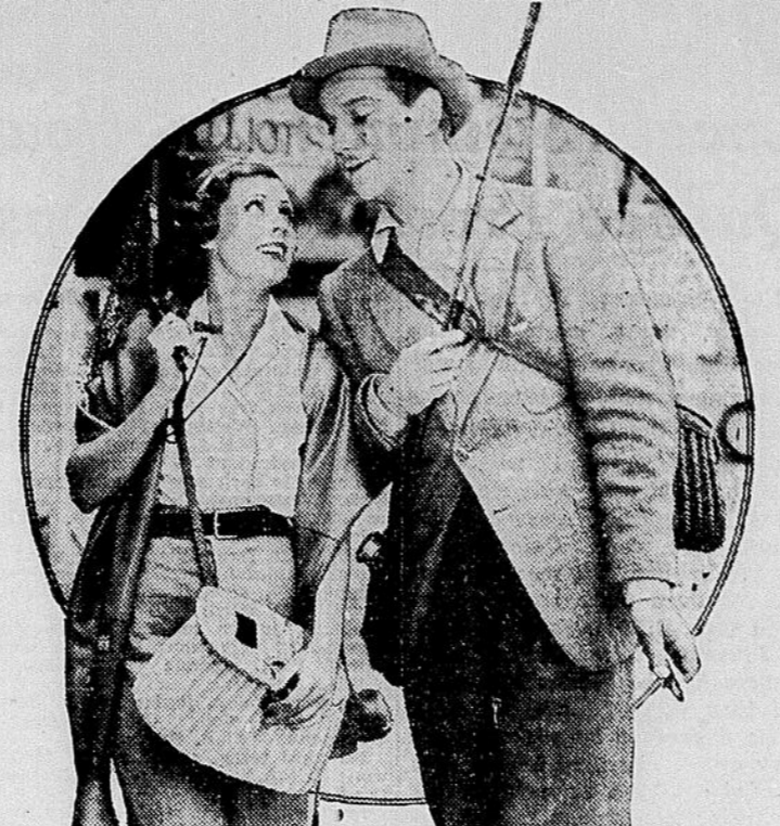
Irene Dunne and Melvyn Douglas together in the gay romantic comedy "Theodora Goes Wild," which is now at the Westmount until Saturday night, opening Sunday for three days at the Seville, and following at the Monkland and then the air-conditioned Snowdon.