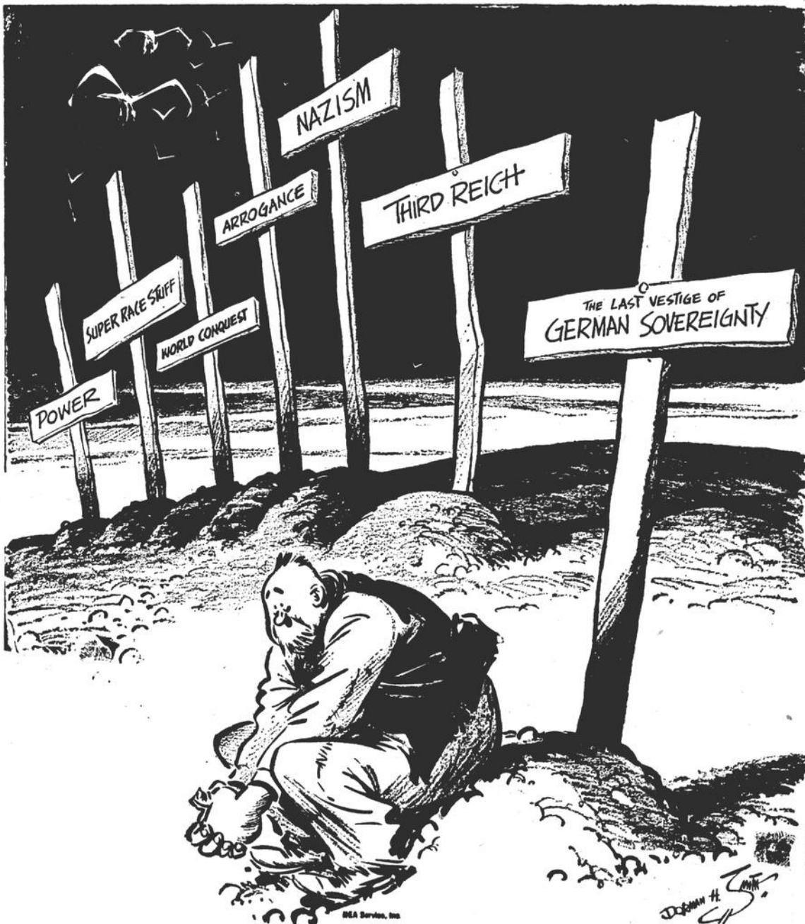
THE SEVENTH CROSS

Wife: "Why not?" Husband: "Because nothing on earth would make you touch a button. Look at my shirt!"