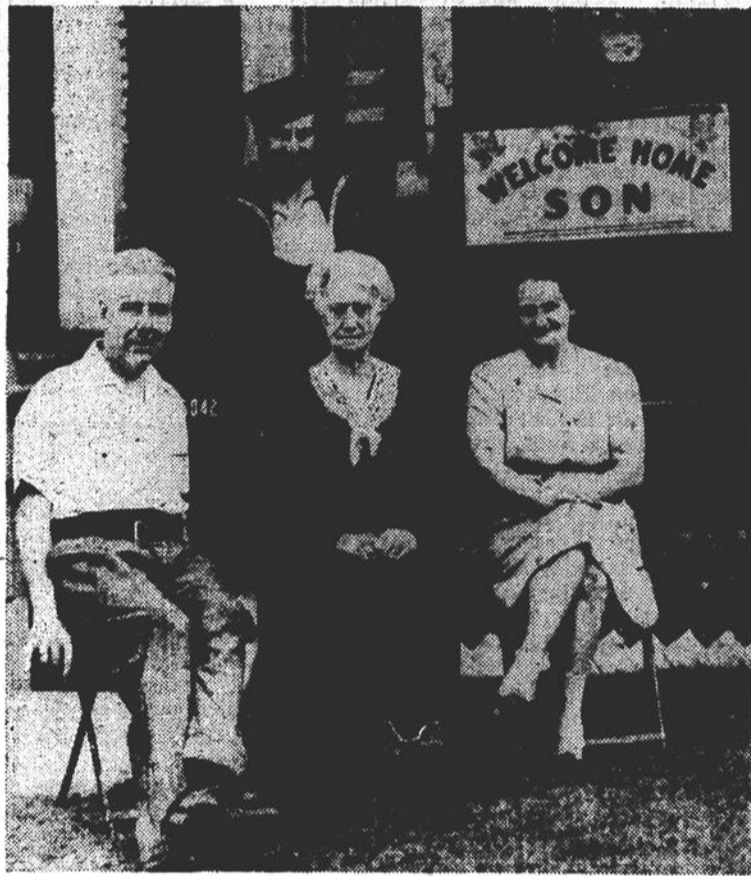
SAILOR REACHES PORT