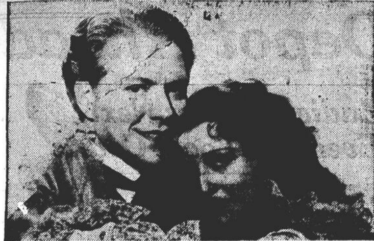
AGAIN THEY SING THEIR WAY INTO YOUR HEARTS! Jeanette Macdonald and Nelson Eddy in the repeat hit film "MAY-TIME," which opens Saturday at the Snowdon United Theatre, playing for one week.