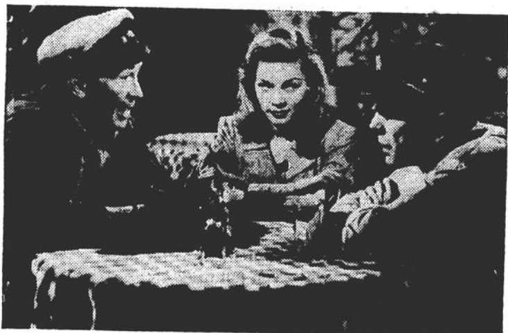
EXCITING DRAMATIC HIT! Walter Brennan, Lauren Bacall and Humphrey Bogart in a scene from the hit film "To Have and Have Not," which opens Saturday at the Seville United Theatre, playing until Tuesday night.

Just about 90 miles north of Montreal in the district around St. Jovite lies excellent hunting grounds. Lakes are filled with trout, and game still roams the hills. Yet there are modern hotels offering golf, riding, tennis, canoeing, swimming, hiking and other sports.