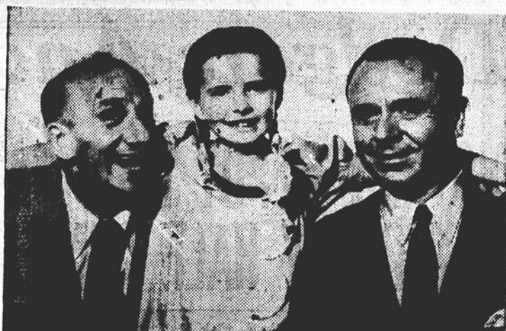
GREAT MUSIC! GREAT HUMAN STORY! Jimmy Durante, Margaret O'Brien and Jose Iturbi, in a scene from the film "Music for Millions," which starts Sunday at the Westmount United Theatre.

But Nalla and her two companions are captured by the slaver and about to be executed when they are rescued by Turhan Bey, leader of a band of escaped slaves. It is Bey whom the royal chamberlain has accused of the murder of her father. It isn't until after