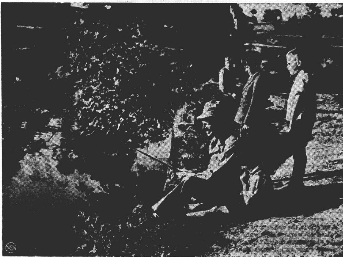
EASTERN TOWNSHIP HOLIDAYS INVITE FISHERMEN

There are many walks along shaded country roads with scenic beauty prevailing on every side and the bracing air of the Townships is cooling and invigorating.