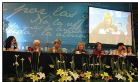
Session « Women and Safety in Urban Spaces », organised by UNIFEM and UN-HABITAT, November 14 2008, Querétaro

At the end of the Colloquium, 75 participants completed the evaluation questionnaire (only 11% of them were ICPC's members). Some of the main findings included: