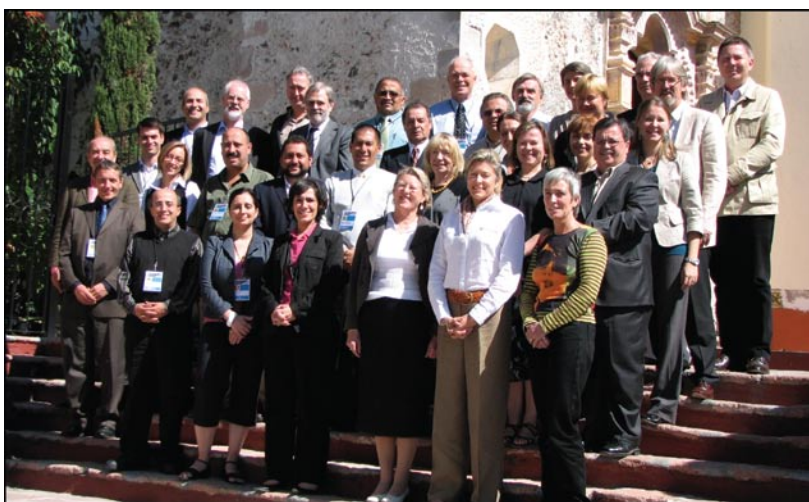
ICPC Members and personnel who were present at governance meetings on November 10 & 11, 2008, Querétaro, Mexico

ICPC held its Annual General Assembly and the Board of Directors meeting on November 10-11, 2008, in Querétaro, Mexico. Twenty-nine members took part in the meetings, in addition to seven administrators who were present, and five who participated by proxy.