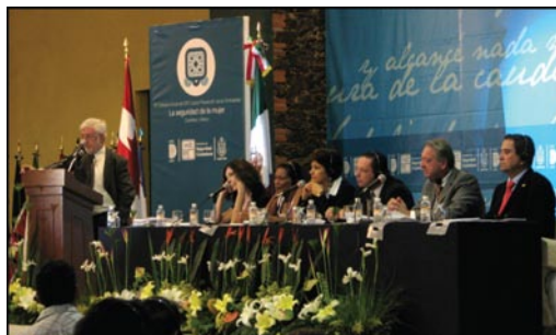
Cities Forum, November 14 2008, Querétaro

Works and Where? ; and on November 14 th , UNIFEM and UN-HABITAT organised a session entitled "Women and Safety in Urban Spaces", in collaboration with Women and Cities International and Red Mujer and UN Habitat.