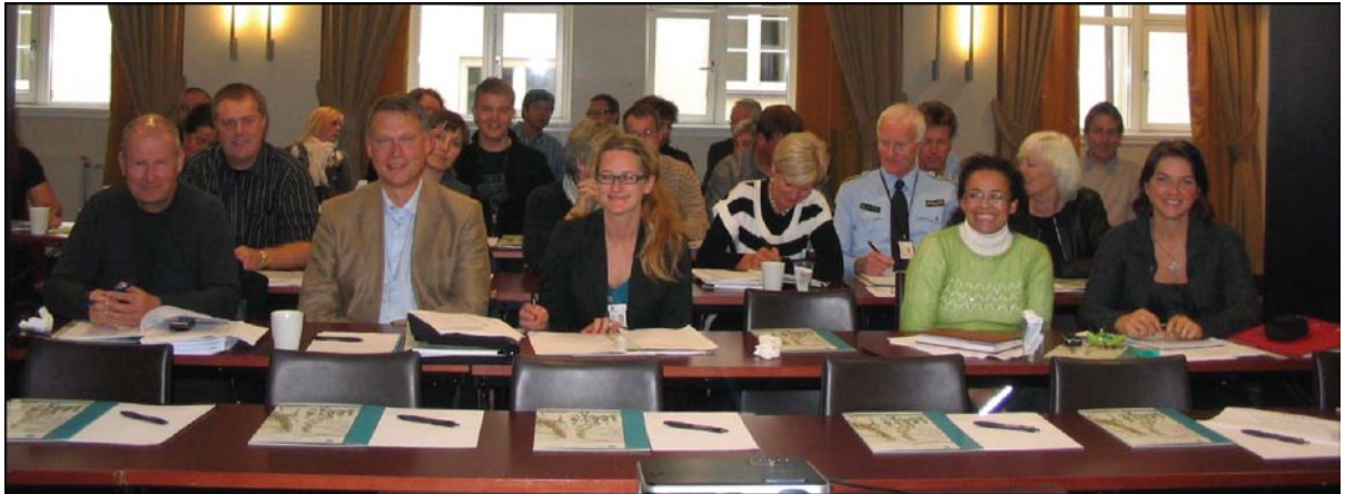
Audience at the launch of the International Report in Oslo, Norway.

The Norwegian National Crime Prevention Council (KRÅD) discussed the Norwegian model “Local Community Police Council”, its operation, challenges and lessons learned. The Oslo Secretary for the Coordination of local crime prevention (SaLTto) debated the crime prevention work in the city of Oslo, which shows that it is possible to make good partnerships based on true knowledge about crime and prevention. The Norwegian National Police University College (PHS) discussed “local police - towards knowledge based policing”, which had many connections to the reports from ICPC. This debate highlighted the importance of crime prevention work being based on good knowledge and solid evidence.