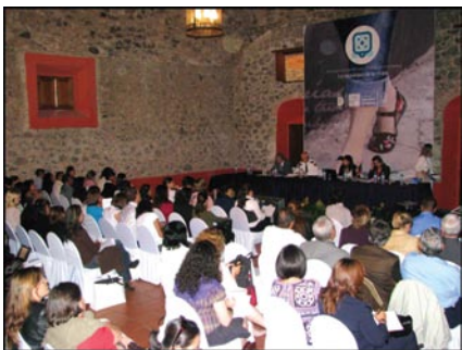
Workshop on Men's Role in Women's Safety, Querétaro

Recognized experts, including representatives from government, police, international organisations, non-governmental organisations, universities and research centres contributed excellent presentations throughout these sessions, encouraging debate and discussion among conference delegates.