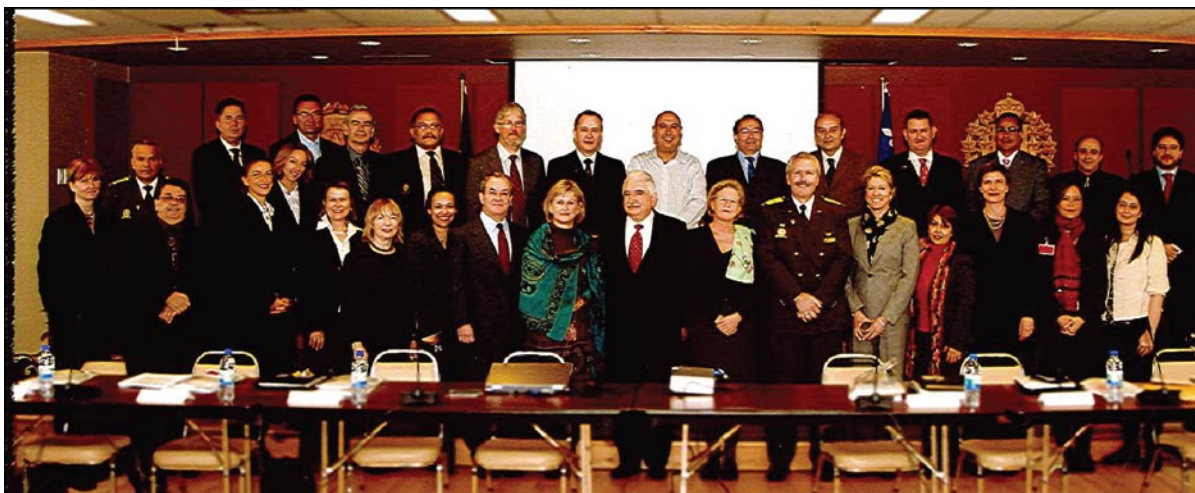
CCO meeting, May 1st-2nd 2008, Sécurité du Québec offices, Montreal

At the time of printing the 2008 Annual report, ICPC's 2008 financial statements are not available. However, the general trend of ICPC's budget demonstrates an increase over the past three years, from $1,499,967 in 2006, to $1,739,230 in 2007, and to $1,859,966 in 2008 (based on the 2008 budget as of September 30, 2008), representing a two-year increase of approximately 20 percent.