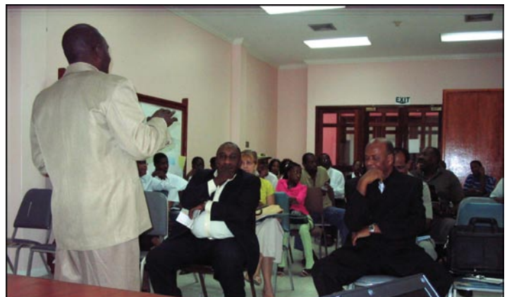
Presentation of the 2008 International Report in Tobago.

Special meeting of government and civil society representatives, October 20-21 st , 2008.