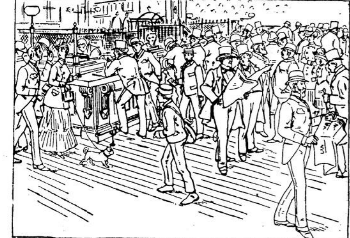
THE "STAR" OFFICE CONTROL ROOM (FOR LAST EDITION).

DAILY CIRCULATION. FIFTEEN YEARS' GROWTH. The expansion in circulation of the DAILY