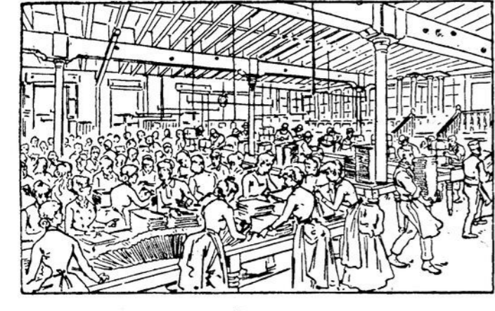
THE "STAR" DESPATCH ROOM.

Excursions Prohibited in France. PARIS, September 21.—Besides prohibiting excursions to this city on the occasion of the coming Republican Government, the Government has forbidden railway excursions to Lourdes and other shrines from infected districts. Hotel-keepers are angry over the loss of their expected harvest.